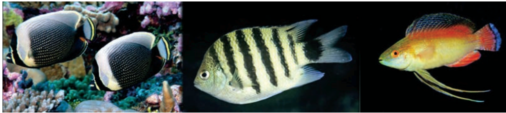
Plate 3.17. New distributional records included (from left to right): Chaetodon reticulatus , Abudefduf lorentzi , and Cirrhilabrus pylei .