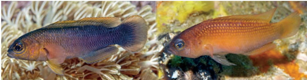
Plate 3.8. Two new Pseudochromis from Bali and Nusa Penida, 7 cm total length.