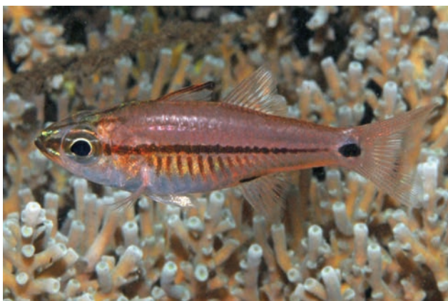
Plate 3.2. Apogon lineomaculus , 6 cm total length. Known only from Bali and Komodo.