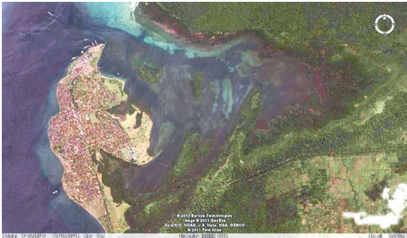
Figure 3.1. Satellite image of Secret Bay at Gilimanuk.

of Nusa Penida. These cases involved crosses between the butterflyfishes Chaetodon guttatissimus and C. punctofasciatus and the angelfishes Centropyge eibli and C. vroliki (Plate 3.4). Although no hybrids were detected between the closely related Chaetodon lunulatus and C. trifasciatus , several mixed pairs between these species were seen during both the 2008 and 2011 surveys.