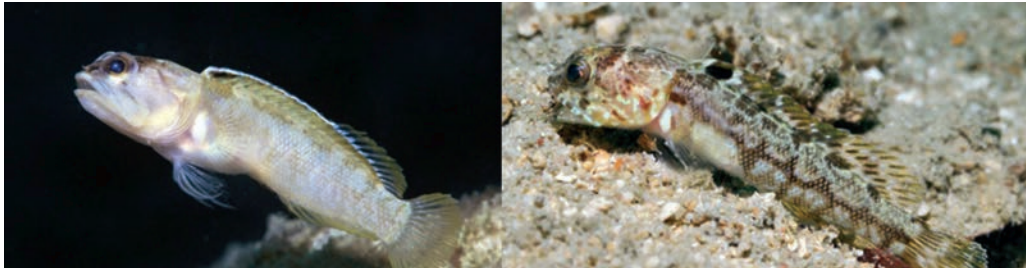
Plate 3.10. Two new jawfishes (Opistognathidae) from Bali (left to right): Opistognathus species 1, 4 cm total length, Opistognathus species 2, 3.5 cm total length.