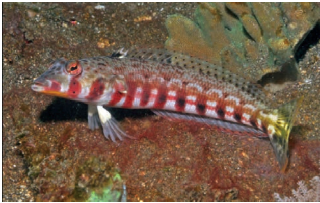
Plate 3.6. Parapercis bimaculata , 11 cm total length.