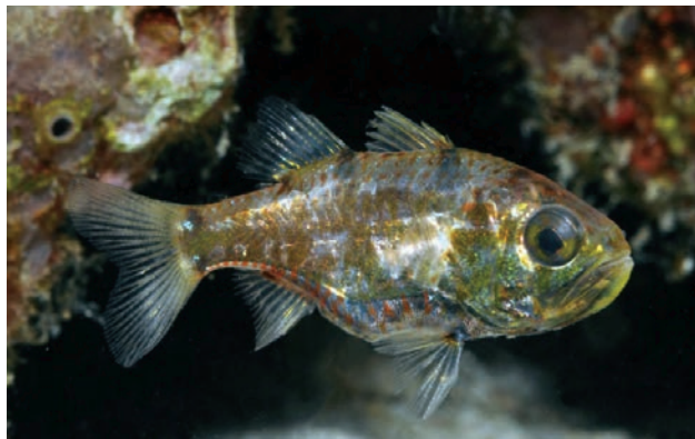
Plate 3.9. Siphamia sp., 3.5 cm total length.