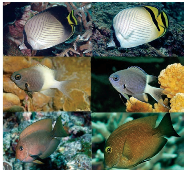
Plate 3.3. Examples of geminate species pairs (Indian Ocean species on left and Pacific species on right): upper— Chaetodon decussatus and C. vagabundus ; middle— Chromis dimidiata and C. margaritifer ; lower— Ctenochaetus cyanocheilus and C. truncatus .