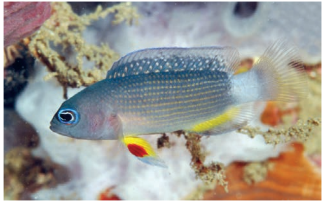
Plate 3.7. Manonichthys sp., 3.5 cm total length.