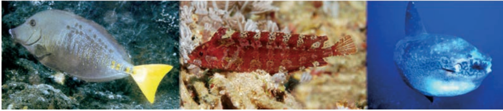
Plate 3.5. Examples of Bali species associated with areas of cool upwelling: from left to right – Prionurus chrysurus , Springeratus xanthosoma , and Mola mola .