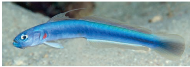
Plate 3.16. Ptereleotris rubristigma , 10 cm total length.