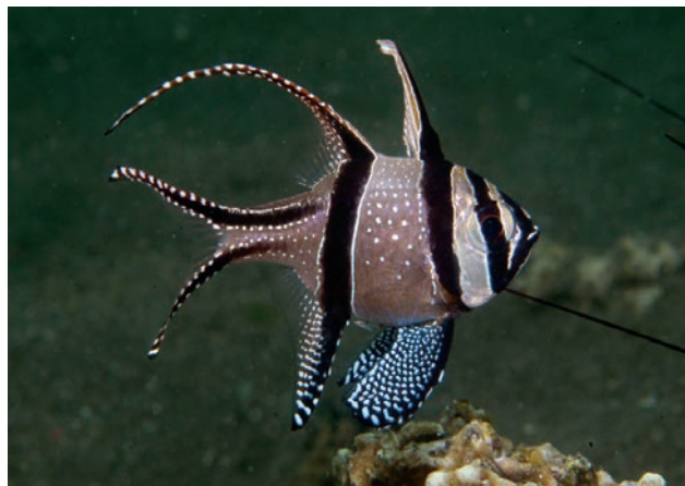
Plate 3.18. The introduced Banggai Cardinalfish ( Pterapogon kauderni ), 8 cm TL, Secret Bay, Bali.