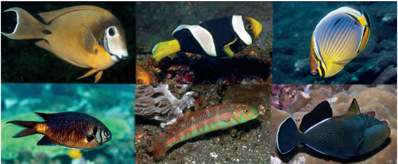
Plate 3.1. Example of Indian Ocean species at Bali (from left to right starting on top): Acanthurus tristis , Amphiprion sebae , Chaetodon trifasciatus , Chromis opercularis , Leptojulis chrysotaenia , and Melichthys indicus .