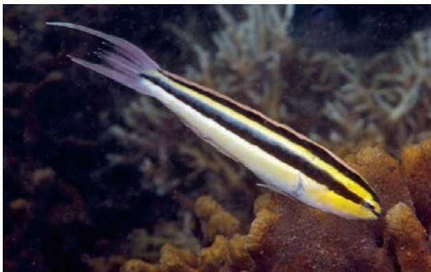
Plate 3.11. Meiacanthus abruptus , 7 cm total length.