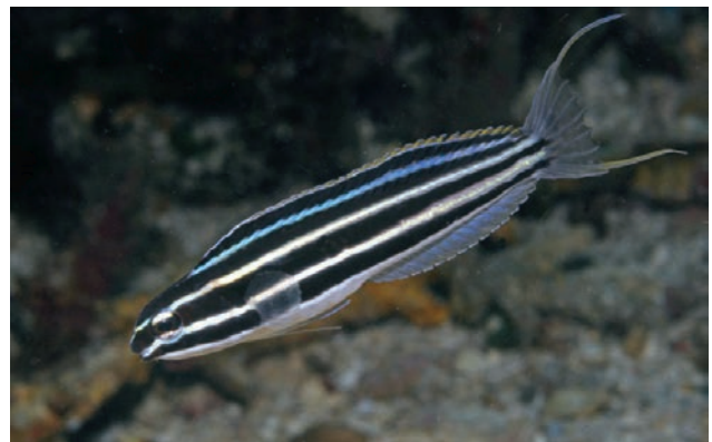
Plate 3.12. Meiacanthus cyanopterus , 6 cm total length.