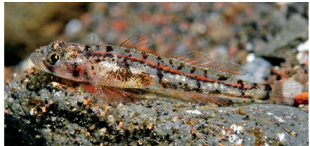
Plate 3.14. Grallenia baliensis , 2.5 cm total length.