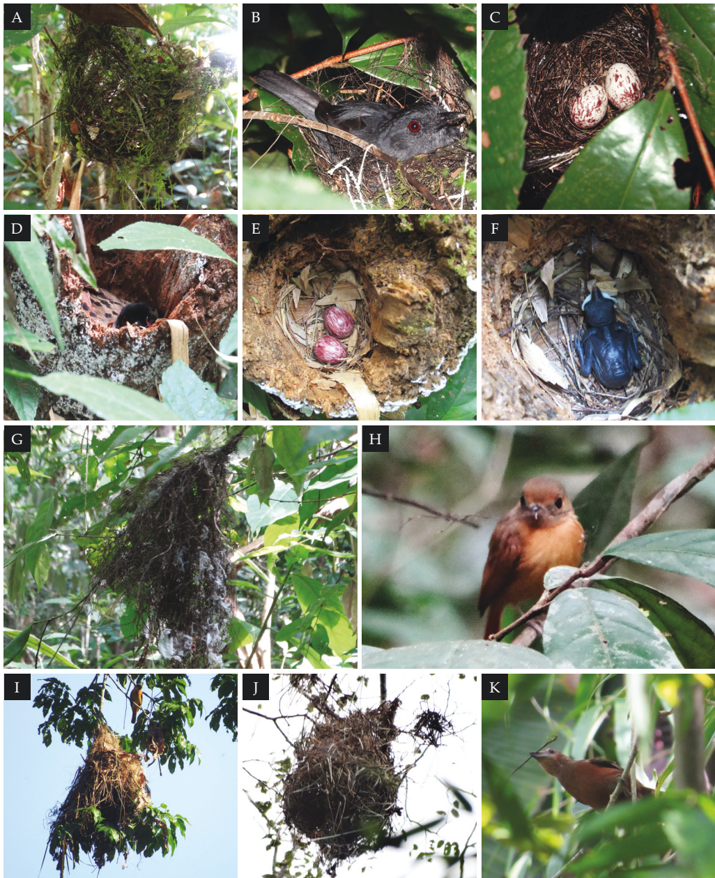
Figure 2. Breeding records of birds in Humaitá Forest Reserve, Porto Acre, Acre state, south-west Amazonian Brazil: (A–C) nest, male and eggs of White-shouldered Antshrike Thamnophilus aethiops ; (D–F) nest, eggs and nestling of Black-spotted Bare-eye Phlegopsis nigromaculata ; (G–H) nest of Ruddy-tailed Flycatcher Terenotriccus erythrurus and adult carrying nesting material; (I) female Pink-throated Becard Pachyramphus minor perched above nest; (J) nest of Olive Oropendola Psarocolius bifasciatus ; (K) female Silver-beaked Tanager Ramphocelus carbo with nesting material (B, C, G, H and J: Jônatas M. Lima; A, D–F, I and K: David P. Guimarães)

but also in the Atlantic Forest and Panama (Skutch 1984, Raine 2007, Zyskowski 2008, Silva & Carmo 2015).