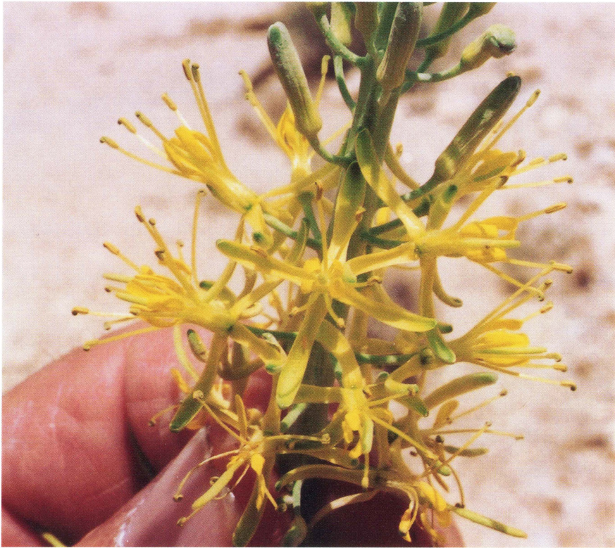
FIG. 3. Stanleya pinnata var. texana , flowers at anthesis.

1963, Correll & Wasshausen 27851 (LL, SRSC); W of Agua Fria Mt., 13 Apr 1936, Cory s.n. (GH); 6 miles NE of Agua Fria Springs, 13 Apr 1936, Cory 18569 (GH); Terlingua Creek, Sep 1883, Havard 70 (GH); desert washes near Terlingua, 1 Apr 1942, Nelson & Nelson 5027 (GH, TEX); 4.6 mi WSW along road to Agua Fria Mt., bentonite clay hills with sparse vegetation, 11 Apr–26 May 1981, Powell 3604 (SRSC, TEX); Road to Agua Fria Mt., W of highway 181, 26 May 1984, Powell 4342 (SRSC, TEX); ca. 5 mi W of Highway 118 along Agua Fria 1985, Poole 2640a (TEX); common locally, 3.5 mi N of Terlingua, road, 18 Apr 1961, Rollins & Correll 6191 (GH, LL); 3 mi SE of Hen Egg Mt., 12 Jun 1949, Turner 1088 (GH, SRSC); N of Terlingua ca. 10 mi, 3 Apr 1938, Warnock C303 (GH, SRSC, TEX) gyp flats N of Agua Fria Mt., 31 Jul 1961, Warnock 18513 (SRSC, TEX).