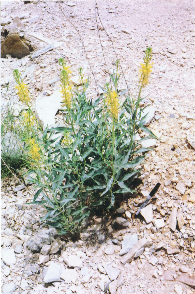
FIG. 2. Stanleya pinnata var. texana at type locality.

secondary inflorescences 20–30 cm long. PEDICELS ca. 1 cm long. SEPALS of mature buds (just before dehiscence) ca. 8 mm, elongating to 8–10 mm. PETALS 8–9(–10) mm long, the blades 4–5 mm long, the claws densely hispidulous, 4–5 mm long. STAMENS 6 (4 long and 2 short), the longer extending about 2 mm beyond the petals, hispidulous below. FRUITING PEDICELS ca. 1 cm long. PODS 5–8 cm long, torulose, gla-