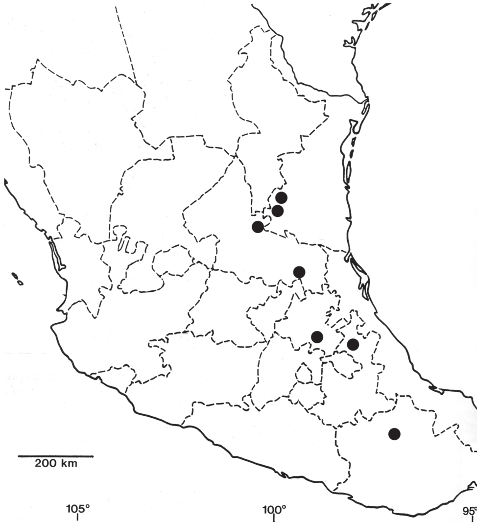
FIG. 1. Distribution of Rhynchosia prostrata .