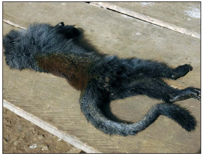
Figure 4. Bioko Preuss's monkey Allochrocebus preussi insularis for sale at the Malabo (‘Semu’) Bushmeat Market, Bioko Island, Equatorial Guinea. This is an Endangered species (IUCN 2009) which is represented on Bioko by an endemic subspecies. Note the short tail which is characteristic of this subspecies. All five of Bioko's threatened species of monkey are sold at this market. No fewer than 2,940 monkeys were sold here during the first 6 months of 2009.