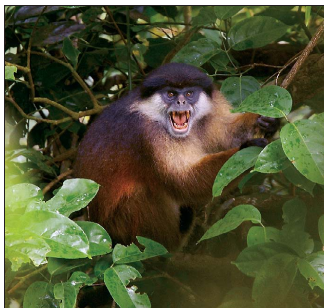
Figure 2. Adult male Bioko red colobus Procolobus pennantii pennantii . This is a Critically Endangered species (IUCN 2009) and one of five threatened species of monkey on Bioko Island, Equatorial Guinea. This subspecies is limited to the southern-western corner (ca. 20%) of Bioko Island.