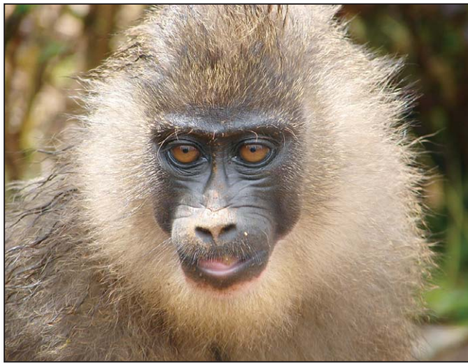
Figure 3. Juvenile Bioko drill Mandrillus leucophaeus poensis . This is an Endangered species (IUCN 2009) which is represented on Bioko Island, Equatorial Guinea by this endemic subspecies. This is the preferred prey of the commercial bushmeat hunters on Bioko. The total number of drills on Bioko as of 2009 is unlikely to be more than 4,000. A photograph of an adult male Bioko drill appears on the front cover of this issue of Primate Conservation .

Unfortunately, red colobus and black colobus Colobus satanas are usually eviscerated by hunters soon after being shot. For these two species the weights of the eviscerated