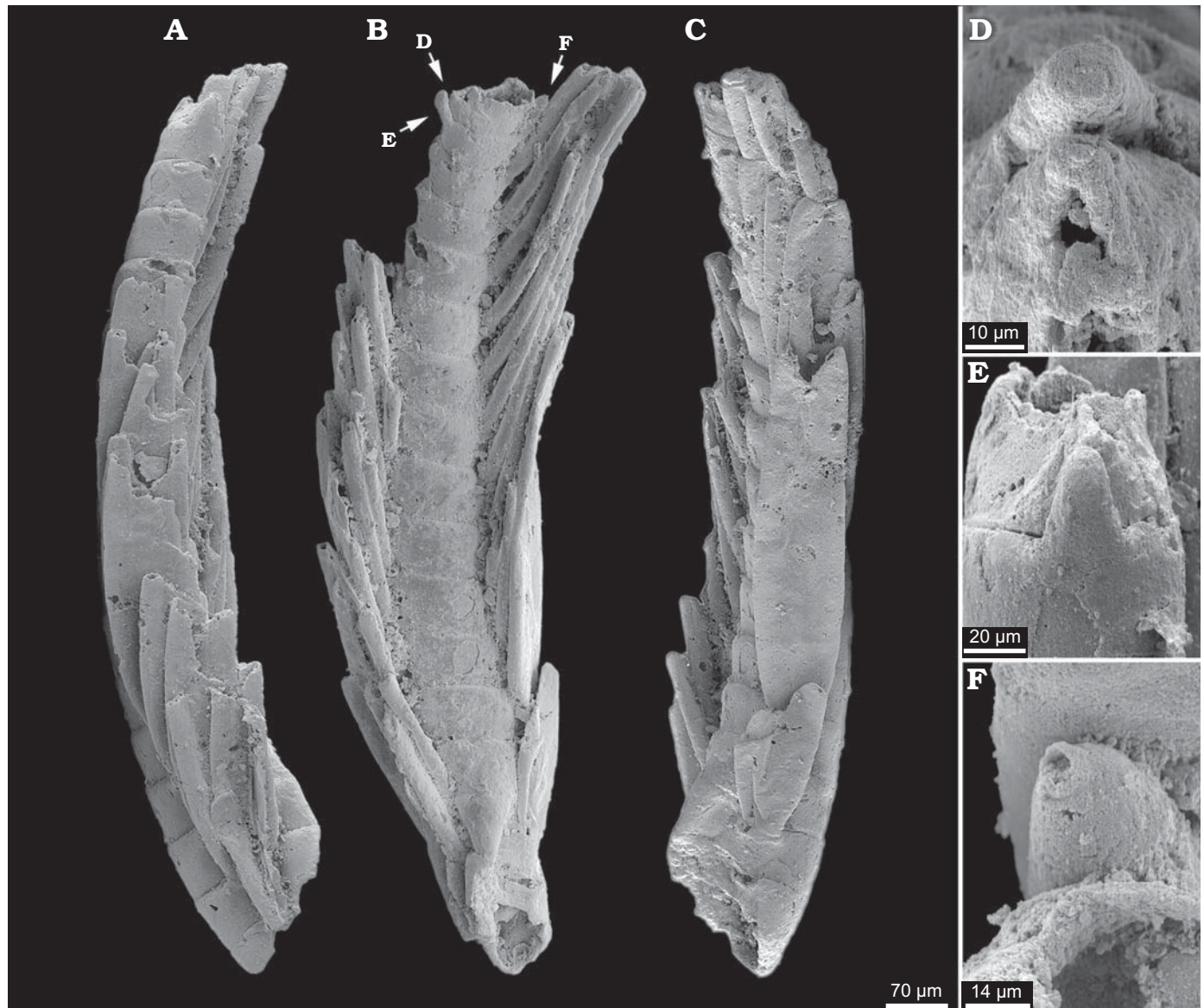
Fig. 1. SEM images of the holotype and single specimen CPC 30719 of marrellomorph Austromarrella klausmuelleri gen. et sp. nov., Mount Murray, Western Queensland, Australia; Series 3 of the Cambrian. A. Median or lateral view, exposing the more or less lanceolate lamellae. B. Anterior or posterior view. The 16 ringlets are well separated from each other. Letters indicate the direction of view in images D–F. C. Median or lateral view, opposing to side displayed in A. Here the insertion of the most proximal preserved ringlet is well apparent. D–F. Details of the stout spines on the most distal preserved annuli viewed as indicated in image B. D. View from latero/medio-proximal on the distal tip. E. View from lateral/median, same spine as in D and E. F. View from medio/latero-proximal. Spine on the other side of the same ringlet as in D and E.

the exopods of the various limbs also are not distinguishable. Crustacea sensu lato (sensu Stein et al. 2008), however, is characterized by two specialized head appendages, i.e., the first and second post-antennular appendages are quite different from the succeeding appendages (see below).