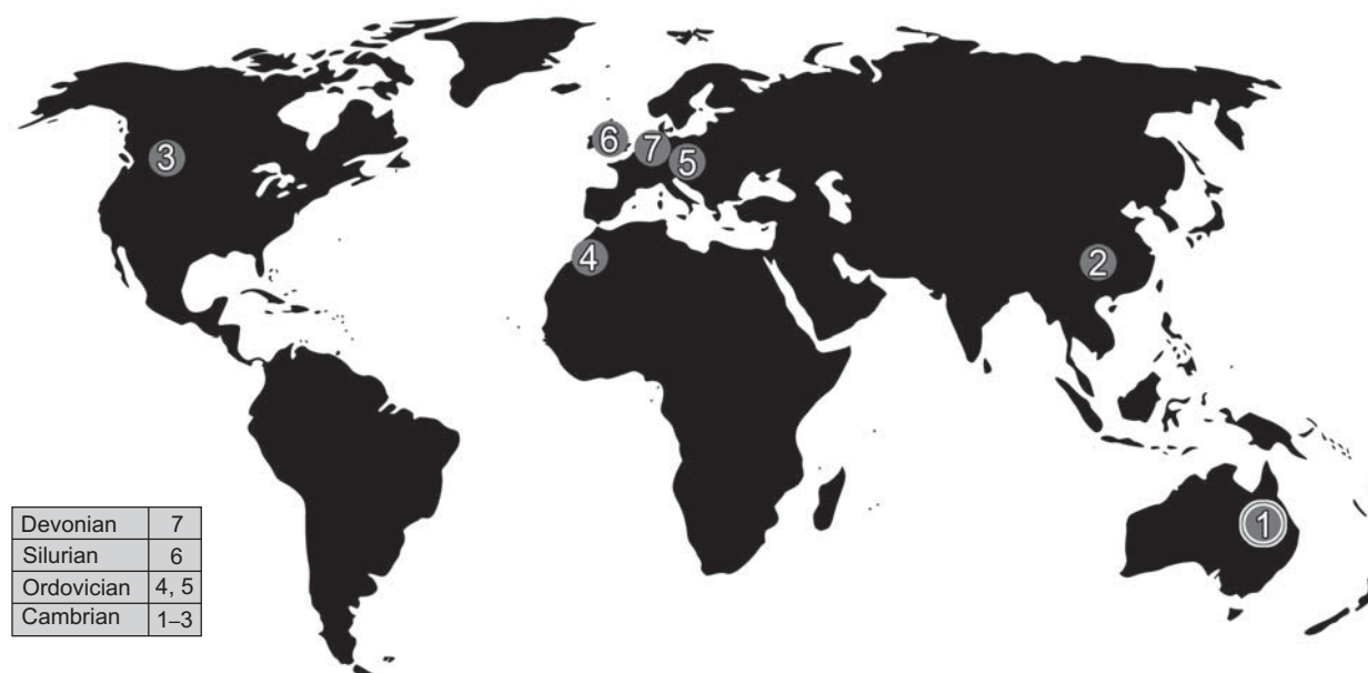
Fig. 4. Localities, in which Marrellomorpha (sensu Kühl et al. 2008) have been found. 1, Monastery Creek Phosphorite Formation, Late Templetonian–Early Floran, Australia: Austromarrella klausmuelleri gen. et sp. nov. 2, Kaili, early middle Cambrian, China: Marrella sp. (Zhao et al. 2003). 3, Burgess Shale, middle Cambrian, British Columbia, Canada: Marrella splendens Walcott, 1912 (Whittington 1971; García-Bellido and Collins 2006). 4, Fezouata biota, Ordovician, Morocco: Furca spp. (Van Roy 2006a, b; Van Roy et al. 2010). 5, Letná Formation, Ordovician, Czech Republic: Furca bohémica Fritsch, 1908 (Chlupáč 1999; Van Roy 2006a, b; Rak 2009; Rak et al. 2013). 6, Herefordshire, Silurian, England: Xylorhis chledophilina Siveter, Fortey, Sutton, Briggs and Siveter, 2007 (Siveter et al. 2007). 7, Hunsrück slate, Lower Devonian, Germany: Vachonisia rogeri Lehmann, 1955 (Kühl et al. 2008); Mimetaster hexagonalis Gürich, 1931 (Kühl and Rust 2010). Table indicates occurrences.

is known from the “Orsten”, and this is significantly smaller than the many species described from Burgess Shale-type lagerstätten.