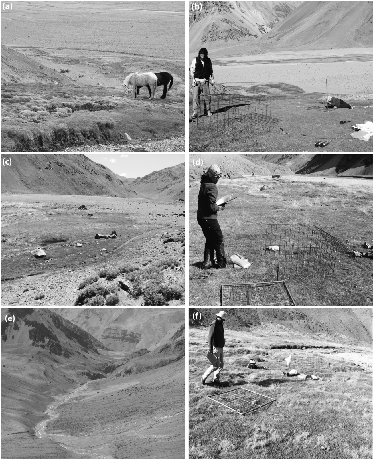
FIGURE 2. General view of the three meadows (left) and of an enclosure in each alpine meadow at the end of the experiment in March 2011 (right) in Aconcagua Provincial Park. (a, b) Meadow 1, (c, d) Meadow 2, and (e, f) Meadow 3.

species. Multiple hits per point were possible where different species occurred at the same point. The number of points that touched litter underneath living vegetation was also recorded. These data were