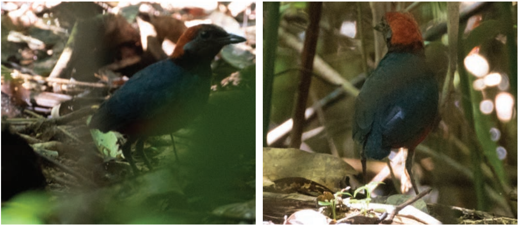
Figure 1A–B. Tabar Pitta Erythropitta splendida , southern Tabar Island, New Guinea, 31 July 2016 (Markus Lagerqvist)