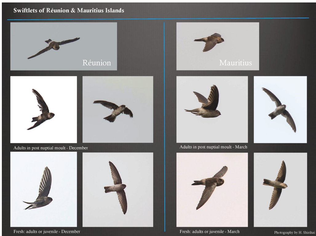
Figure 4. Comparative field photographs of the Reunion and Mauritius populations of Mascarene Swiftlet Aerodramus francicus in both fresh (lower line) and very worn plumages (middle line); the bird top left is at the extreme end of variation in the white rump patch of this island's population (Hadoram Shirihai)

patterned below than those of nominate francicus , displaying much more obvious shaft-streaks on the lower breast and belly, and a sharper division between the darker throat and breast vs. paler (and greyer) remainder of the underparts; in nominate francicus this pectoral band effect is much reduced, as well as being much higher on the breast. A. f. saffordi is separated from the similar but larger and darker Aerodramus elaphrus of the Seychelles by most of the same characters as can be used to distinguish the latter from nominate francicus , namely the shorter wings and bill of saffordi ( A. elaphrus has wing 115–119 mm and bill to feathers 7.5–8.0 mm; Rocamora 2013), its narrower wing base and smaller eye. In contrast to nominate francicus , the rump patch of saffordi being rather less obvious within the otherwise dark upperparts, is more similar to A. elaphrus .