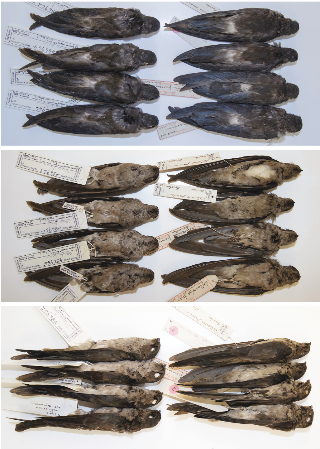
Figure 1. Dorsal, ventral and lateral views of the (USNM 486962) and three paratypes (USNM 486964–966) of Mascarene Swiftlet Aerodramus francicus saffordi (holotype, at left), collected in northern Reunion, in November 1964, compared to four specimens (NHMUK 1844.10.19.3, 1844.10.19.3, 1890.12.16.39, 1890.12.16.40) of A. f. francicus, collected on Mauritius on unknown dates in the 19th century