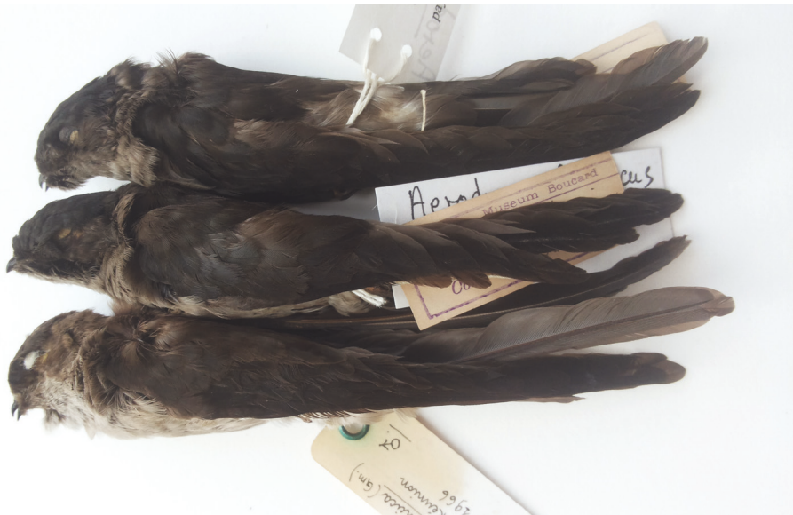
Figure 5. Two specimens of Aerodramus f. francicus (MNHN 2003-3403 and 2003-3404; top two) collected on Mauritius on unknown dates, previously in the Boucard collection, compared to a specimen of A. f. saffordi (MNHN 2000-823) collected on Reunion in July 1966

Drab, or slightly darker (119B Dark Drab) forming a very broad and somewhat diffuse breast-band, below which the remainder of the underparts (belly to undertail-coverts) become paler (between 119C and 119D); especially from the mid-breast across the belly, shaft-streaks are very well pronounced and there are dark feather centres exposed between the lower throat and upper breast forming a broken mesial stripe. Underwing-coverts as top of head (nearest to Color 119), but underside of remiges marginally paler (between Color 119 Sepia and 119A Hair Brown). Bare parts all dark post-mortem (original colours unknown).