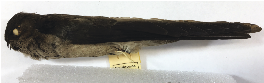
Figure 6. Specimen of Aerodramus f. francicus (UMMZ 210026), collected on Mauritius, in September 1964, showing glossy wings and upperparts

Chapelle, Cirque de Cilaos, in the centre of Reunion (Cheke & Hume 2008). However, at least some caves (potential breeding sites) are almost certainly inaccessible and detailed surveys do not appear to have been attempted, in contrast to the situation on Mauritius (Safford 2013).