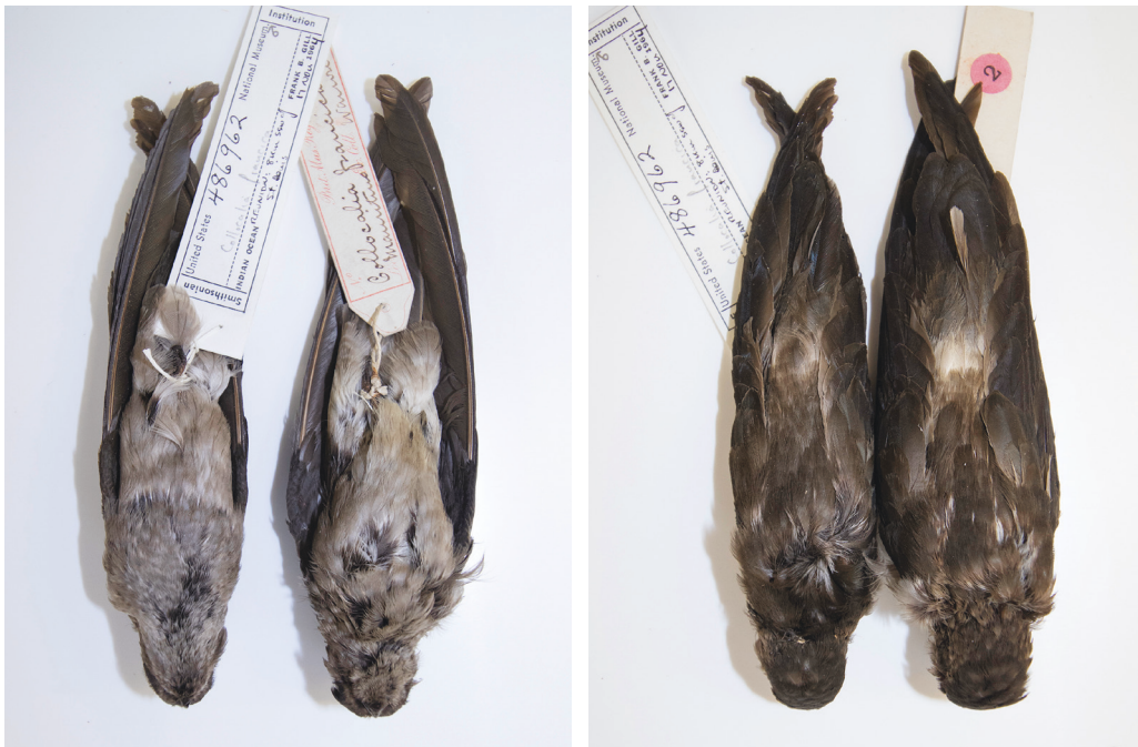
Figure 2. Ventral, dorsal and lateral views of the holotype (USNM 486962) of Mascarene Swiftlet Aerodramus francicus saffordi, collected 8 km south-southwest of Saint-Denis (20°52'44"S, 55°26'53"E), northern Reunion, on 17 November 1964, compared to a specimen (NHMUK 1844.10.19.5) of A. f. francicus, collected on Mauritius on an unknown date in the 19th century; USNM 486962 is on the left in the first two images and above in the lateral view