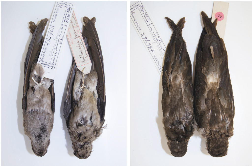
Figure 2. Ventral, dorsal and lateral views of the holotype (USNM 486962) of Mascarene Swiftlet Aerodramus francicus saffordi, collected 8 km south-southwest of Saint-Denis (20°52'44"S, 55°26'53"E), northern Reunion, on 17 November 1964, compared to a specimen (NHMUK 1844.10.19.5) of A. f. francicus, collected on Mauritius on an unknown date in the 19th century; USNM 486962 is on the left in the first two images and above in the lateral view