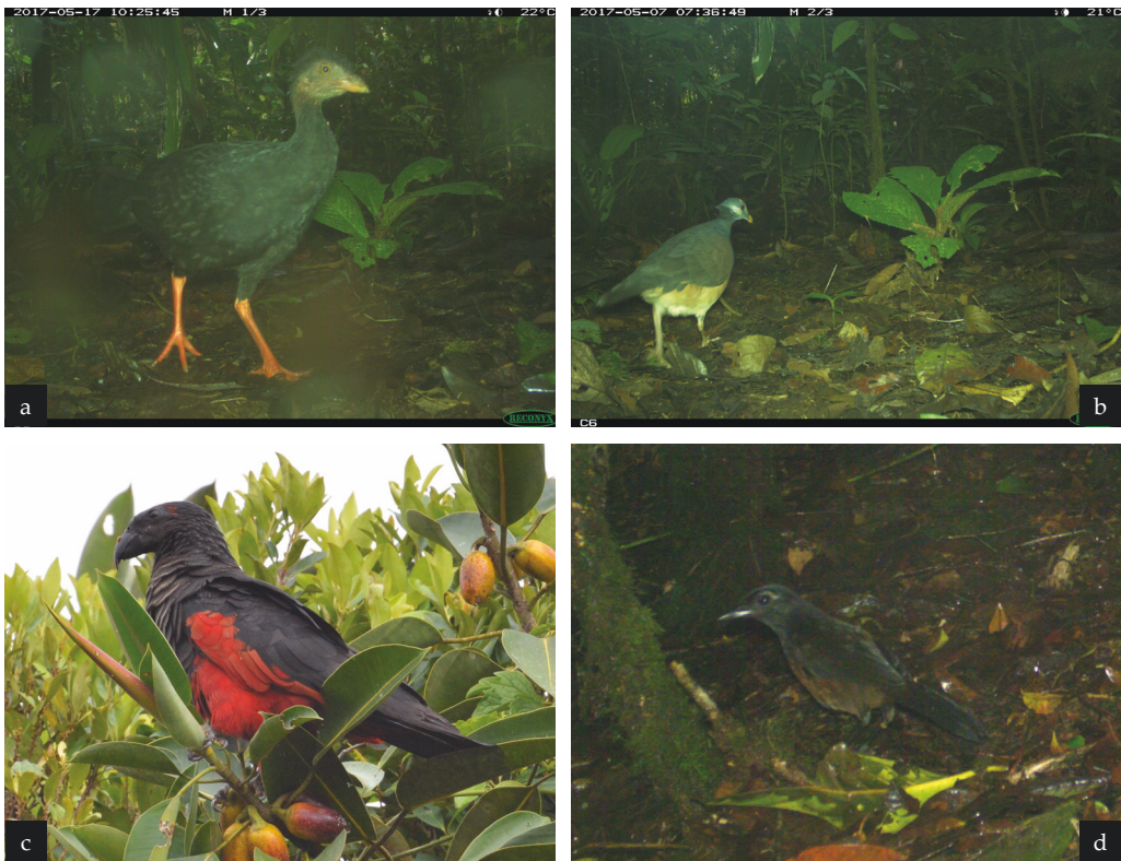
Figure 2(a) Red-legged Brushturkey Talegalla jobiensis ; (b) Thick-billed Ground Pigeon Trugon terrestris ; (c) New Guinea Vulturine Parrot Psittrichas fulgidus ; (d) Greater Melampitta Megalampitta gigantea , all camera-trapped in the Agogo Range.