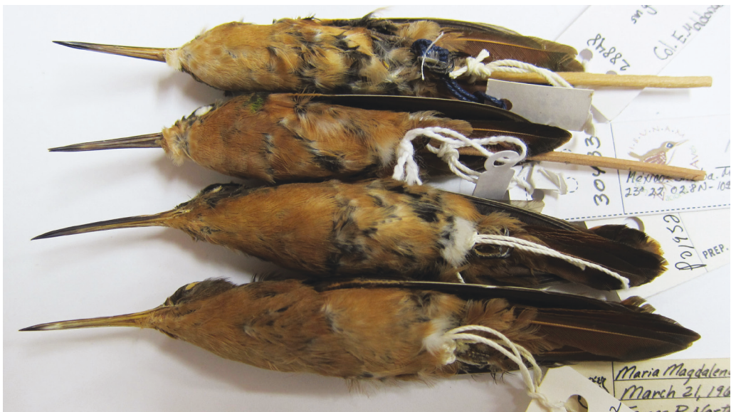
Figure 9. Two specimens of Cinnamon Hummingbird Amazilia rutila graysoni (below) compared with two specimens of A. r. rutila (above); note the considerable difference in size. The second specimen from the top is the darkest-throated A. r. rutila at Instituto de Biología, Universidad Nacional Autónoma de México; the right side of its throat is paler than the left, and thus more like the typical colour of the subspecies (Héctor Gómez de Silva)

Scored 4 by del Hoyo & Collar (2014) based on larger size in all external measurements (to which they assign a score of 3) and slightly ‘darker and duskier’ plumage (which they score 1). Regarding colour differences, Grant (1965a, based on 27 male and 18 female graysoni vs. 46 male and 14 female rutila ) stated that the underparts are uniformly dark cinnamon vs. paler cinnamon, particularly on the chin and throat. The belly of some mainland rutila at IBUNAM is as dark as the underparts of graysoni , but the chin and throat, and often asymmetrical patches on the breast, are always paler (Fig. 9). Grant (1965a) also mentioned that the upperparts are ‘dark green or even red-bronze’ vs. ‘paler green, and in those which have a bronze colour it is always yellow-green, never red’, and that the ‘tips’ ( sic , actually, subterminal portions) of most, particularly the outer, rectrices are dark greenish bronze to