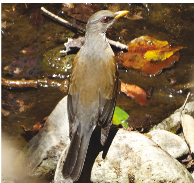
Figure 22. Rufous-backed Robin Turdus rufopalliatu graysoni with brown back and wing-coverts resembling the upperparts colours of White-throated Thrush T. assimilis , Isla María Cleofas, May 2016 (Héctor Gómez de Silva)