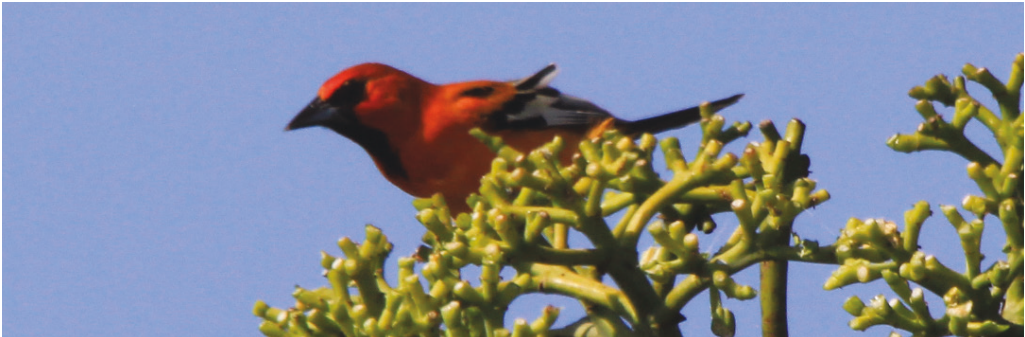
Figure 16. An intensely orange individual of Streak-backed Oriole Icterus pustulatus graysoni , Isla María Cleofas, March 2016

Additional information. —Cortés-Rodríguez et al. (2008) and Ortiz-Ramírez et al. (2018) found reciprocal monophyly but shallow genetic divergence between graysonii and mainland specimens. Shallow genetic divergence is also seen in other sister species of orioles even when they possess distinctly different plumage features (e.g. Kondo et al. 2004).