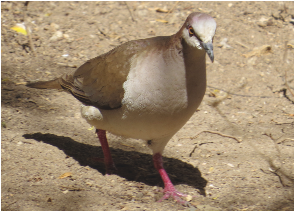
Figure 17. Above: White-tipped Dove Leptotila verreauxi angelica , Cruz de Huanacastle, Nayarit, Mexico, April 2019, below: L. v. capitalis , Isla María Cleofas, May 2016; note the contrasting white forecrown and cheeks, extensively whitish underparts, and darker brown back, wings and tail

of island birds the vinous breast colour extended less far onto the belly than approximately 75% of mainland birds; 'hence island birds appear to have a larger, white abdomen' (Grant 1965a). The face is whiter due to the ear-coverts being white or whitish vs. usually pale pinkish grey, and because the white forehead reaches further posteriorly and contrasts