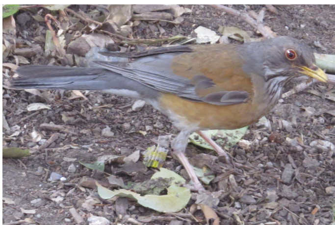
Figure 21. Mainland Rufous-backed Robin Turdus rufopalliatu far from the range of T. r. graysoni with a salmon wash on the breast resembling some graysoni, Parque María Enriqueta, Mexico City, June 2017.