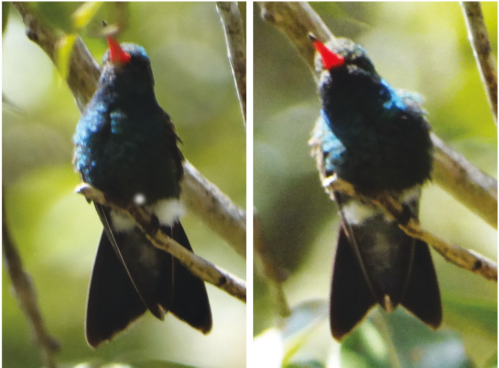
Figure 8. Presumed hybrid Broad-billed Hummingbird Cyananthus lawrencei × magicus specimen, Isla María Cleofas, April 2016 (Héctor Gómez de Silva)

only remaining undertail-covert feather typical of lawrencei while, contra Grant (1965a), MLZ 41912 has the anterior feathers grey-brown and the posterior undertail-coverts very pale whitish grey (like the IBUNAM material in Fig. 5; MLZ specimen photos, courtesy of J. Maley).