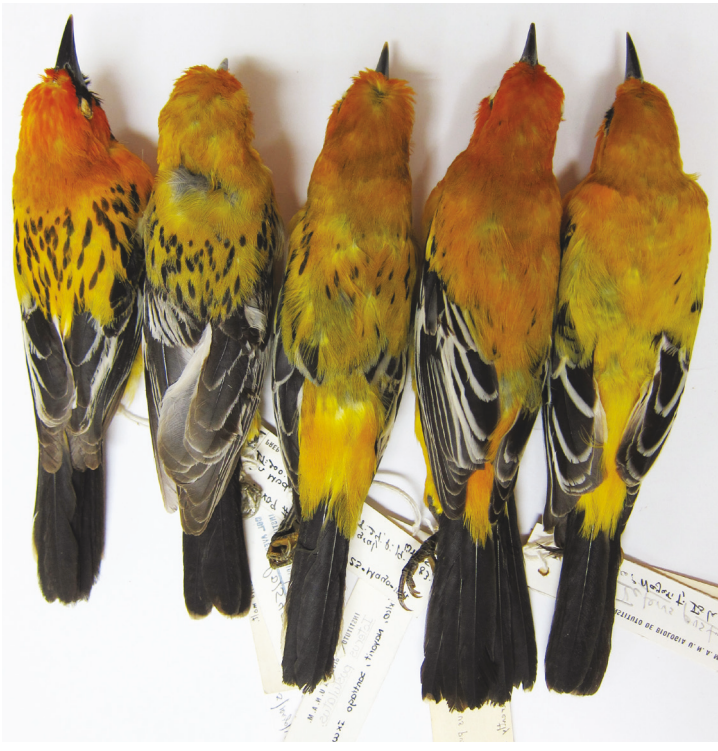
Figure 15. Back pattern, size and intensity of orange in Streak-backed Oriole Icterus pustulatus specimens from Nayarit, from left to right: two typical microstictus / yaegeri , two presumed hybrids (with Phillips' specimen at right) and a typical graysoni ; note the similar overall size of graysoni and Phillips' specimen, which is, however, more orange overall (especially the head), while the other presumed hybrid (which appears almost as long due to specimen preparation) has back streaks intermediate between graysoni and typical mainland Nayarit orioles (Héctor Gómez de Silva)