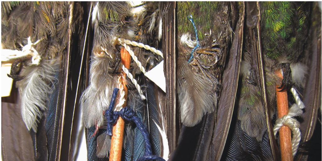
Fig. 4. Typical undertail-coverts colour of male Broad-billed Hummingbird Cyananthus latirostris magicus (two specimens at left) and C. l. lawrencei (two specimens at right), from specimens in the Instituto de Biología, Universidad Nacional Autónoma de México collection (Héctor Gómez de Silva)