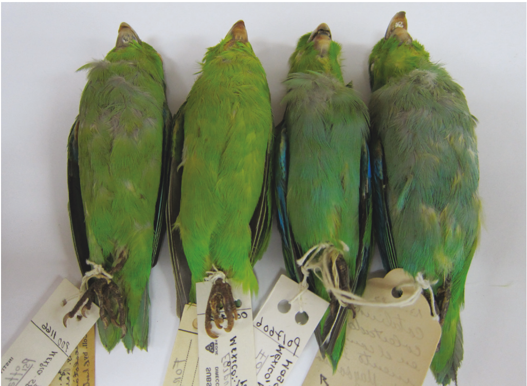
Figure 12. Instituto de Biología, Universidad Nacional Autónoma de México specimens of Mexican Parrotlet Forpus cyanopygius from Nayarit; the two specimens on the right are adult male insularis , their malachite-green breast and belly contrasts strongly with the throat, unlike in cyanopygius specimens (Héctor Gómez de Silva)