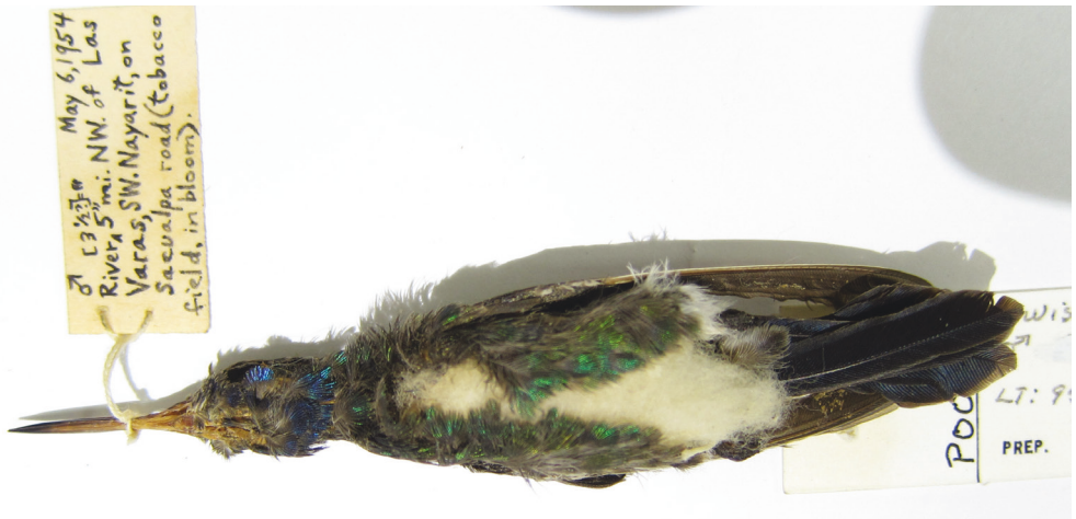
Figure 7. Presumed hybrid Broad-billed Hummingbird Cyananthus lawrencei × magicus specimen in the Instituto de Biología, Universidad Nacional Autónoma de México collection; note magicus -like blue throat and lawrencei -like white-edged grey undertail-coverts (Héctor Gómez de Silva)