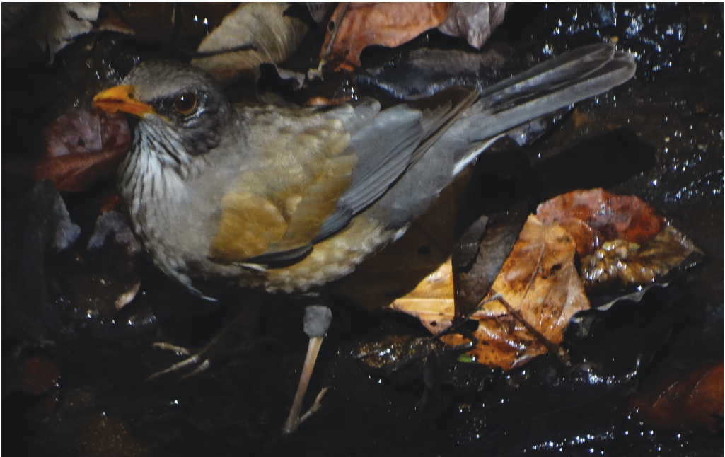
Figure 18. Typical Rufous-backed Robin Turdus rufopalliatus graysoni with broad grey breast-band concolorous with head and nape, pale salmon flanks, brown back and wing-coverts with very little back / nape contrast, and rather narrow throat streaks, Isla María Cleofas, May 2016