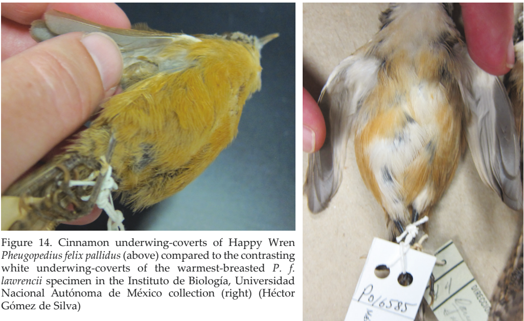
Figure 14. Cinnamon underwing-coverts of Happy Wren Pheugopedius felix pallidus (above) compared to the contrasting white underwing-coverts of the warmest-breasted P. f. lawrencii specimen in the Instituto de Biología, Universidad Nacional Autónoma de México collection (right) (Héctor Gómez de Silva)