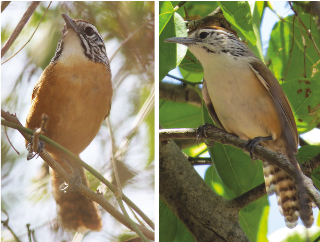
Figure 13. Left: typical underparts colour and cheek pattern in Happy Wren Pheugopedius felix pallidus, Laguna El Chumbeño, Francisco Villa, Nayarit, Mexico, May 2016 ; right: P. f. lawrencii, Isla María Cleofas, April 2016