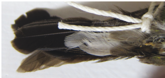
Figure 6. Mainland specimens of male Broad-billed Hummingbird Cynanthus latirostris magicus with grey undertail-coverts (usually white or whitish) (Héctor Gómez de Silva)