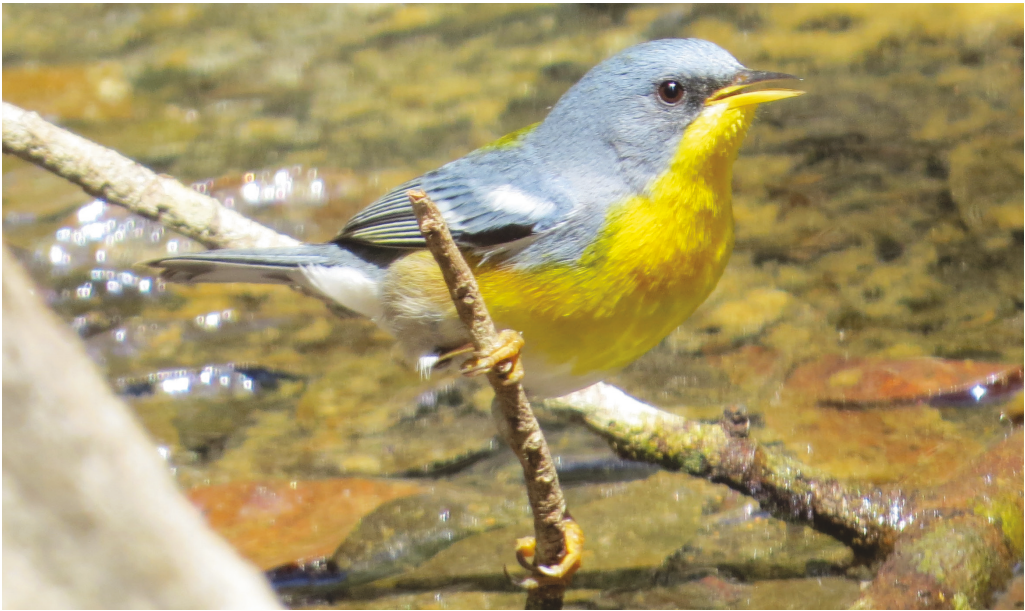
Figure 23. Tropical Parula Setophaga pitiayumi insularis , Isla María Cleofas, May 2016; note the reddish-tinged flanks and lack of black feathers above the base of bill

insularis may partially bridge the gap between S. p. pulchra and race graysoni from Socorro Island. Tail length of insularis is much closer to graysoni than pulchra (Ridgway 1902; under Socorro Parula, del Hoyo & Collar 2016 cite mean tail lengths for male insularis and pulchra that are too short, cf. Ridgway 1902).