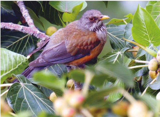
Figure 19. Mainland Rufous-backed Robin Turdus rufopalliatus far from the Tres Mariás, with an anomalous grey breast-band resembling T. r. graysoni and note the prominent throat streaks and warm-coloured back, wing-coverts and flanks, Cuernavaca, Morelos, Mexico, June 2017

rufous' and sides and flanks dull orange-brown vs. rufous (Phillips 1991), which seem like subtle distinctions. All or most individuals we photographed on the Tres Mariás had sides and flanks similar to some mainland rufopalliatus (e.g., Fig. 21, http://2.bp.blogspot.com/-G0D2EpXGckI/VHZA0MTHSjI/AAAAAAAAACSQ/sMP9Yby2Yic/s1600/_DSC0103.JPG ). Grant (1965a) mentioned that graysoni 'show a tendency to possess paler and narrower chin and throat streaks than mainland birds, easily recognizable only when the extreme forms of the two samples are compared' (consistent with, e.g., Figs. 18 and 20). Phillips (1991) mentioned 'feet apparently darker' in graysoni but did not evidence this, and it is not supported by our field observations. In conclusion, individuals of graysoni representing the