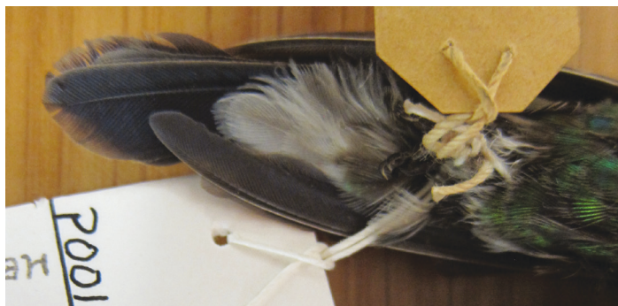
Figure 5. Two specimens of male Broad-billed Hummingbirds Cynanthus latirostris with similarly grey anterior undertail-coverts and white or whitish posterior undertail-coverts; above C. l. magicus , below, C. l. lawrencei