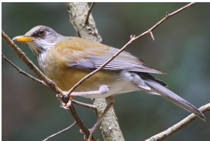
Figure 20. Presumed Rufous-backed Robin Turdus rufopalliatu graysoni with mainly narrow throat streaks, a strong salmon wash on the breast, and wing-coverts and back colours close to those of non- graysoni T. rufopalliatu , Isla María Cleofas, November 2015