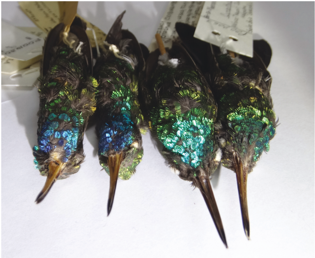
Figure 3. Throat colours of Broad-billed Hummingbird Cyananthus latirostris specimens in the Instituto de Biología, Universidad Nacional Autónoma de México collection, on left: two C. l. magicus , right: two C. l. lawrencei ; the apparently larger size and bills of the lawrencei specimens are an artefact of the photograph (Héctor Gómez de Silva)