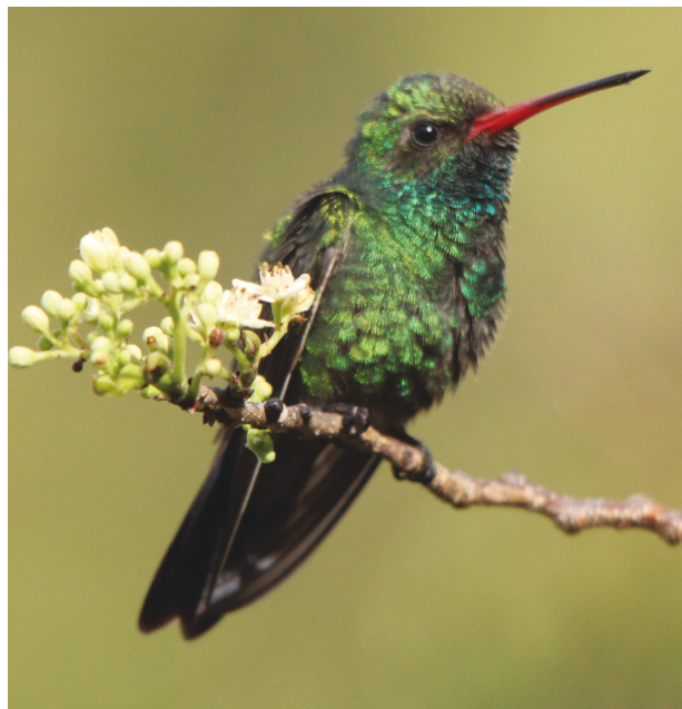
Figure 2. Male Broad-billed Hummingbird Cyanthus latirostris lawrencei , Isla María Cleofas, May 2016 (Javier Cruz Nieto)

Collar 2014). Of 11 male specimens of lawrencei at IBUNAM in which it is possible to see the undertail-coverts, typical colours are present in nine specimens but P019534 has a two-toned pattern in which the anterior feathers are typical of lawrencei but the largest, posterior feathers are predominantly white with very pale grey central portions, very similar to magicus P001630 from Sinaloa (Fig. 5). Also, the usually whitish undertail-coverts of magicus reach their greyest extreme in P001631 and P020047 (Fig. 6), albeit a pearly grey rather than the brownish grey of lawrencei . We do not believe that any of these specimens are hybrids because no other character suggests this, and their geographic location is too far removed from the Tres Marías (e.g., P020047 is from too far north and inland for lawrencei to be a plausible parent).