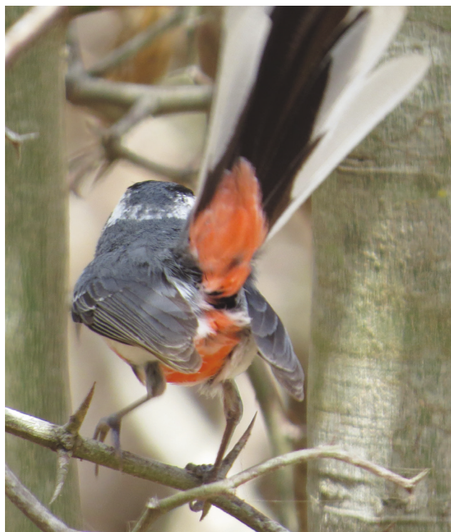
Figure 10. Comparison of the nape and presence / absence of the white hindcollar in male Red-breasted Chat Granatellus venustus : above, Instituto de Biología, Universidad Nacional Autónoma de México specimen of G. v. venustus ; below, G. v. francescae, Isla María Cleofas, May 2016