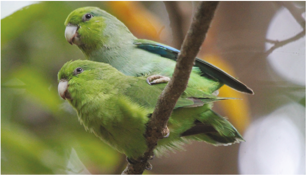
Figure 11. Pair of Mexican Parrotlets Forpus cyanopygius insularis copulating, Isla María Cleofas, May 2016; note the male's pale malachite-green underparts, neck-sides and postocular region contrasting with the yellower green cheeks, throat, forehead and forecrown, and that the male's undertail-coverts are not concolorous with the breast and belly ( contra Grant 1965a) (Javier Cruz Nieto)