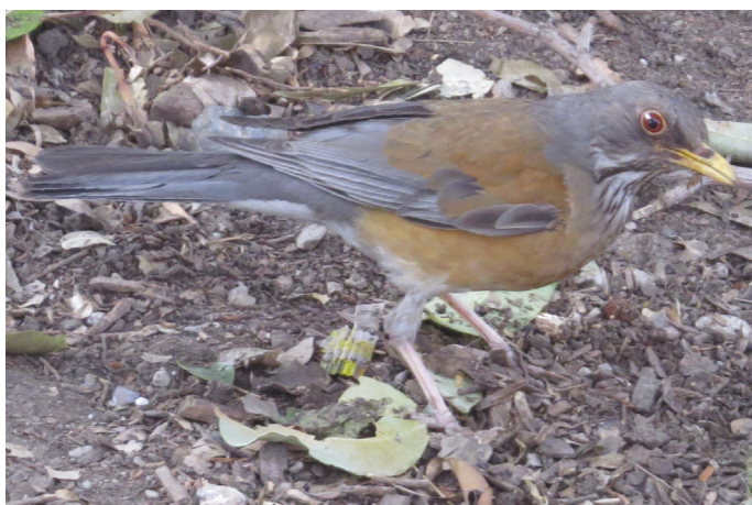
Figure 21. Mainland Rufous-backed Robin Turdus rufopalliatatus far from the range of T. r. graysoni with a salmon wash on the breast resembling some graysoni, Parque María Enriqueta, Mexico City, June 2017.