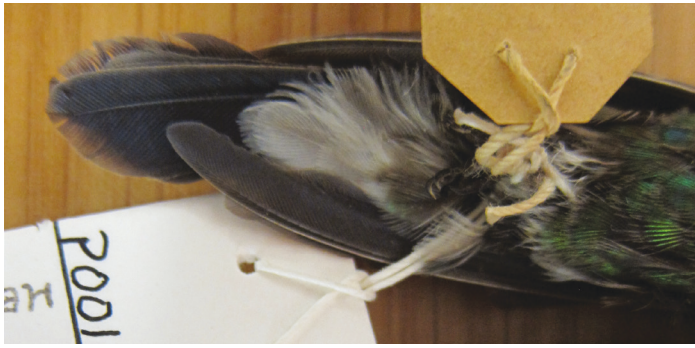
Figure 5. Two specimens of male Broad-billed Hummingbirds Cynanthus latirostris with similarly grey anterior undertail-coverts and white or whitish posterior undertail-coverts; above C. l. magicus , below, C. l. lawrencei (Héctor Gómez de Silva)