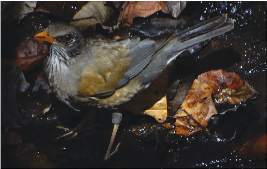
Figure 18. Typical Rufous-backed Robin Turdus rufopalliatus graysoni with broad grey breast-band concolorous with head and nape, pale salmon flanks, brown back and wing-coverts with very little back / nape contrast, and rather narrow throat streaks, Isla María Cleofas, May 2016