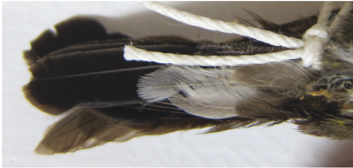
Figure 6. Mainland specimens of male Broad-billed Hummingbird Cynanthus latirostris magicus with grey undertail-coverts (usually white or whitish) (Héctor Gómez de Silva)