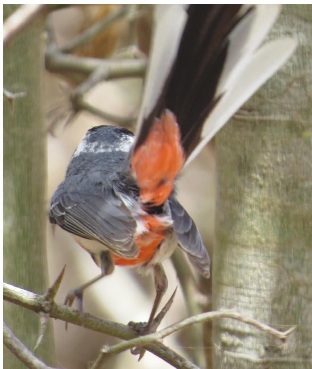
Figure 10. Comparison of the nape and presence / absence of the white hindcollar in male Red-breasted Chat Granatellus venustus : above, Instituto de Biología, Universidad Nacional Autónoma de México specimen of G. v. venustus ; below, G. v. francescae, Isla María Cleofas, May 2016