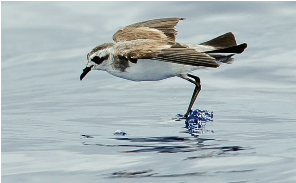
Figure 6. White-faced Storm Petrel Pelagodroma marina , off Rapa, Austral Islands, French Polynesia, December 2019; note combination of sullied pale greyish rump, moderately developed dark breast-side patches, and clean white underparts

of Rapa / Marotiri in September 2006, and a live bird and a dead individual on Rurutu Island in October 2010 (Thibault & Cibois 2017). Seven more records (of ten individuals) are available from across East Polynesia, including an undated sighting for the Line Islands (Thibault & Cibois 2017).