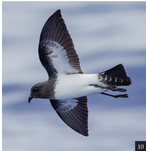
Figures 7–10. ‘Classic’ Titan Storm Petrels Fregetta [grallaria] titan , Rapa Island, Austral Islands, French Polynesia, November–December 2019 (Tubenoses Project © H. Shirihai). The plumage of ‘classic’ titan includes broad white fringes to the scapulars, mantle to rump, and upperwing greater, median and longest lesser secondary-coverts. Fig. 7 offers a closer look at the broad white fringes to the mantle to rump feathers, which are abraded and worn off on a few old, browner feathers. The bird in Fig. 8 has undergone head and body moult, with blackish-grey scapulars and mantle to rump, strongly contrasting with the mainly old, browner upperwing-coverts without white fringes. Note the sparse dark streaking on the body-sides in Fig. 8, but lacking in Fig. 10.

occur/s in East Polynesia away from Rapa and Marotiri, but Titan Storm Petrel apparently disperses a significant distance given these two records from much further north and east.