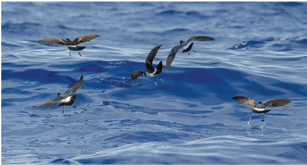
Figure 5. Two Polynesian Storm Petrels Nesofregatta fuliginosa (top and centre left) and three 'classic' Titan Storm Petrels Fregatta [grallaria] titan , Rapa Island, Austral Islands, French Polynesia, November 2019, showing the exceptionally large size of titan relative to other Fregatta , and approaching that of the particularly large Rapa form of N. fuliginosa

Petrels Nesofregatta fuliginosa (Fig. 5). On 24 October, two were seen when approaching Marotiri from the north-east, two were attracted to chum in calm conditions in five hours close to Marotiri and, on departure towards Rapa, four were attracted to the yacht's stern using a fish oil drip. However, c. 60 came to chum there on 24 November. Off Rapa observed throughout the survey period, with max. daily counts in each month involving c. 90 on 25 October, 120 on 12 November, and >100 on 3 December.