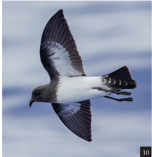
Figures 7–10. ‘Classic’ Titan Storm Petrels Fregetta [grallaria] titan , Rapa Island, Austral Islands, French Polynesia, November–December 2019. The plumage of ‘classic’ titan includes broad white fringes to the scapulars, mantle to rump, and upperwing greater, median and longest lesser secondary-coverts. Fig. 7 offers a closer look at the broad white fringes to the mantle to rump feathers, which are abraded and worn off on a few old, browner feathers. The bird in Fig. 8 has undergone head and body moult, with blackish-grey scapulars and mantle to rump, strongly contrasting with the mainly old, browner upperwing-coverts without white fringes. Note the sparse dark streaking on the body-sides in Fig. 8, but lacking in Fig. 10.

occur/s in East Polynesia away from Rapa and Marotiri, but Titan Storm Petrel apparently disperses a significant distance given these two records from much further north and east.