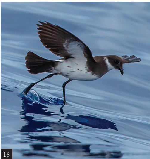
Figures 14–16. Polynesian Storm Petrels Nesofregatta fuliginosa , Rapa Island, Austral Islands, French Polynesia, December 2019. Unique ‘bicoloured’ plumage, with a blackish-brown hood and broad dark breast-band separated by a white ‘cut-throat’, narrow white crescent on the tail base, and pale wingbar tipped with buff. We noted two main variations. Some show sparse and narrow dark streaks on the otherwise white body-sides (Figs. 15–16). The number of underwing greater primary-coverts that are dark with white fringes varies from the four outermost (Fig. 15) to all of them (Fig. 16), but in the latter case on the innermost coverts the dark area is paler and the white fringes broader.