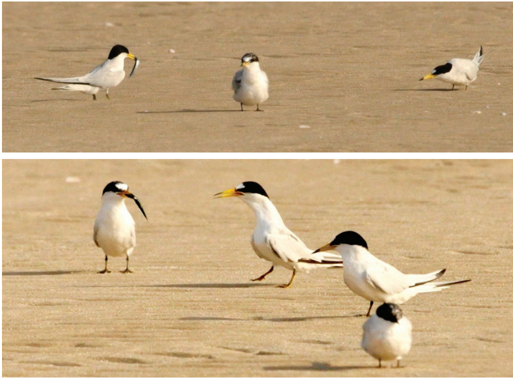
Figure 6. Courtship-feeding by Saunders's Terns Sternula saundersi , San Sebastian Peninsula, Mozambique, 2 September 2019. A. (top) male (left) 'parading', carrying food while female (right) adopts receptive hunched posture. B. (lower) both birds in 'erect posture' after fish presented, with head up and carpal free from body in male; note Damara Tern S. balaenarum in foreground (Christine Read)