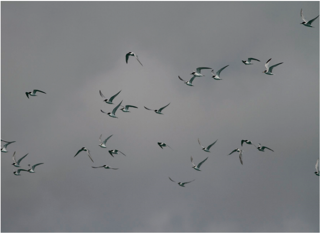
Figure 3. Part of a flock of Damara Terns Sternula balaenarum , including one Saunders's Tern S. saundersi and four Sternula spp., San Sebastian, Mozambique, 30 October 2019 (Niall Perrins)

On 2 September 2019 CR found 29 Damara Terns in breeding plumage at Rattray's Point, and DG observed 17+ there on 15 September. With increasing observer interest, larger numbers were found, all loafing on the same area of sandbanks, including 75 on 18 September and a max. 100+ on 24–28 October. Numbers then quickly declined to single figures by mid November. In 2020 none was seen in two visits in February, but 15–25 were recorded in May–July. In 2021 none was seen in January, but 80 in May and 106 in August (Appendix 1).