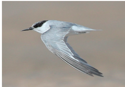
Figure 9. Damara Tern Sternula balaenarum , San Sebastian Peninsula, Mozambique, 9 May 2021. An adult in non-breeding plumage illustrating the dark primary wedge that can be shown in advanced primary moult. The otherwise monotone upperwing, with an ill-defined carpal bar, separates it from Little S. albifrons and Saunders's Terns S. saundersi in similar plumages; note also pale primary shafts

The findings reported here suggest that Damara Tern may occur in the Indian Ocean, conceivably even as far north as Somalia, in April–September, presenting a new identification challenge in the Indian Ocean. Little Terns should be present in small numbers in the region at this time, but these may be second-calendar-year birds in faded, non-breeding plumage, and probably in active moult. Damara Tern is in non-breeding plumage until at least early September and whilst notionally straightforward to separate from Little / Saunders's Terns by the uniform pearl-grey upperparts, fine-tipped black bill and shorter-legged appearance at rest (pers. obs.), these characters are only diagnostic with good views and in direct comparison. A uniform outer wing and lack of contrasting darker outer primaries is a good feature in freshly moulted Damara Terns, but care is needed as birds in post-breeding primary moult can develop a very similar outer wing pattern to Little / Saunders's Terns, since their older outer primaries darken with age and contrast with the growing inner feathers (Fig. 9). Damara Tern tends to have a dusky, ill-defined carpal bar in fresh non-breeding plumage (Hockey et al. 2005) but this fades to leave a more uniform overall tone to the upperwing (pers. obs.). Clear white primary shafts and pale legs are additional features in good views. As yet, there is no good illustration of Damara Tern in non-breeding plumage, the most accurate being in Borrow & Demey (2014).