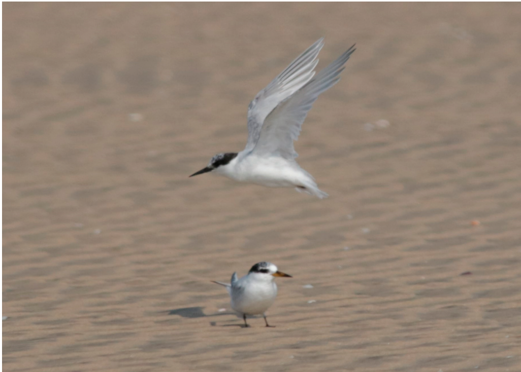
Figure 1. Damara Tern Sterna balaenarum (above) and Saunders's Tern S. saundersi (below; this individual identified from other images), Rattray's Point, San Sebastian Peninsula, Mozambique, 6 August 2018; note fine-tipped all-dark bill, grizzled crown, forehead and above eye, and relatively pale outer primaries of Damara Tern (Gary Allport)