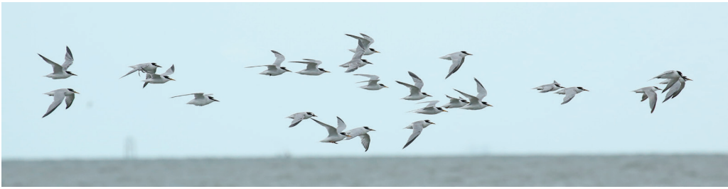
Figure 4. Little Terns Sternula a. albifrons were common on pelagic trips off southern Mozambique, October–April, but infrequent and occurred in small numbers onshore except at a small number of undisturbed roost sites, or in bad weather. Maputo Bay, Mozambique, 23 February 2016

Recent records in Mozambique. —In nine years of observations in southern Mozambique Little / Saunders’s Terns were recorded in every month (2010–19; GA pers. obs.), but positive identifications were determined only for birds in breeding plumage. There were a small number of positively identified Little Terns in late September and more as they attained breeding plumage in February–April. No field observations of birds in the period October–January were considered identifiable to species and they were treated as Little / Saunders’s but all photographs were re-examined in light of Mullarney & Campbell (2020) and all those identifiable were Little. The majority of non-breeding plumage birds were probably Little rather than Saunders’s Terns. Where subspecific identification was possible, all were S. a. albifrons and sinensis was not suspected.