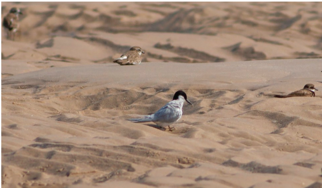
Figure 2. Damara Tern Sternula balaenarum , Rattray's Point, San Sebastian Peninsula, Mozambique, 28 September 2018; diagnostic all-dark cap and nape in breeding plumage (David Gilroy)