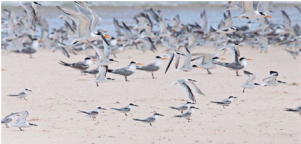
Figure 7. Part of a group of at least 26 Saunders's Terns Sternula saundersi , Rattray's Point, San Sebastian Peninsula, Mozambique, 31 December 2018; non-breeding birds identified using criteria developed by Mullarney & Campbell (2022) for separation from Little Tern S. albifrons . The head pattern shows a narrow black line behind the eye with a pure white rear crown and lacks a white 'notch' or hint of eyestripe above the eye, the mantle is pale grey and wings tricoloured, with white secondaries and a contrasting dark carpal bar (Christine Read)