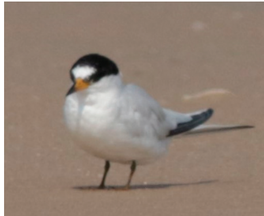
Figure 5. Saunders's Tern Sternula saundersi , Rattray's Point, San Sebastian Peninsula, Mozambique, 6 August 2018; first record for Mozambique and southern Africa. Note square-cut white forehead not extending above eye, at least three dark outer primaries and contrastingly pale, pearly-washed mantle (vs. blue lead-grey in Little Tern) and dull-coloured legs (Gary Allport)

Based on Little Terns (Cramp 1985), the behaviours observed in September 2019 were interpreted as at least one pair in courtship with a male carrying fish, 'parading', and a female adopting a receptive 'hunched' posture (Fig. 6A) followed, after presentation of the fish, by 'erect-posture' by both birds (Fig. 6B). This type of courtship-feeding is thought to establish and maintain pair bonds and is normally a pre-requisite to successful copulation, but the behavioural sequence observed in Little Terns prior to copulation is different from courtship-feeding (Cramp 1985) and we did not observe attempted copulation by Saunders's Terns.