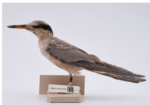
Figure 10. Little Tern Sternula a. albifrons collected at 'Port Natal' (now Durban), South Africa. Mentioned by Schlegel (1863) but no date of collection given. Cited by Saunders & Salvin (1896) as evidence of saundersi occurring in South Africa but lack of black outer primaries and darker grey inner upperwing show this to be a Little Tern

Naturalis specimen. —Photographed by staff at Naturalis (Fig. 10). There is no collection date, but it appears to be an adult, probably attaining breeding plumage with all-fresh primaries (so had probably recently completed wing moult), and partial breeding head pattern and bill coloration. From these characters, the collecting date is estimated to have been mid February to early April. It has dark primary shafts on the upperside but no clearly darker outer primaries, therefore supporting G. F. Mees' conclusion that this a Little Tern of the nominate race.