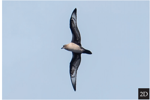
Figures 2A–E. Five dark-morph Herald Petrels Pterodroma heraldica , off Ua Pou, Marquesas Islands, French Polynesia, South Pacific, 1–5 October 2021; Fig. 2C taken over submerged atoll Guyot Kena, c.17 miles south-east of Ua Pou at 09°35'20.4"S, 139°46'30"W, all others 1.5–3.0 miles off east coast of Ua Pou. Each of following pairs of figures shows one bird: Figs. 1 and 2D, Figs. 2A and 9, and Figs. 2B and 3A. The individuals show slight variation in the extent of white basally in the primaries and greater primary-coverts, and paleness of the underparts (latter affected by lighting). However, without exception, the white basal primary panels are large and pronounced, which alone separates dark-morph Herald Petrel from Henderson Petrel P. atrata with its 'all-dark' underwing (Fig. 11A–B)

subtle ghosting of light morph plumage, suggesting intermediate morph (e.g., Figs. 2A and 9 show same bird under different lighting conditions, Fig. 9 suggesting intermediate morph).