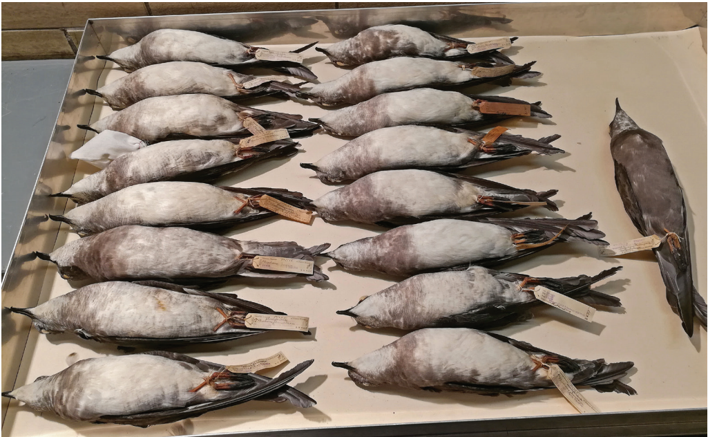
Figure 6. Herald Petrel Pterodroma heraldica specimens, Ducie Atoll, Pitcairn Islands, South Pacific. Light morphs, except intermediate morph AMNH 191366 (left row, third from bottom, collected 20 March 1922), and dark morph AMNH 191592 (far right, collected 20 March 1922, also shown in Figs. 4D, 5 and 10). Note, some light morphs have dusky markings encroaching onto the belly (e.g., left row, second from bottom), but in our definition the intermediate morph uniquely has a complete dusky lower breast to undertail-coverts, plus an enlarged diffuse dark breast-band