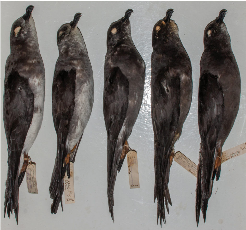
Figure 5. Comparison of light, intermediate and dark-morph Herald Petrels Pterodroma heraldica (left-hand three specimens) with Henderson Petrels P. atrata (right-hand two specimens), at American Museum of Natural History (AMNH), from left to right: (1) light-morph Herald Petrel (AMNH 191569), Ducie Atoll, Pitcairn Islands, South Pacific, (2) intermediate-morph Herald Petrel (AMNH 191642), Henderson Island, Pitcairn Islands, South Pacific, (3) dark-morph Herald Petrel (AMNH 191592, also shown in Figs. 4D, 6, 10), Ducie Atoll, Pitcairn Islands, South Pacific, 20 March 1922, (4) Henderson Petrel (AMNH 191753), Henderson Island, Pitcairn Islands, South Pacific, (5) Henderson Petrel (AMNH 191553), Henderson Island, Pitcairn Islands, South Pacific; note that (1) is a typical light-morph Herald Petrel, (2) an intermediate-morph Herald Petrel with a complete dark-flecked dusky lower breast to undertail-coverts, (3) a typical dark-morph Herald Petrel, and (4) and (5) are typical Henderson Petrels