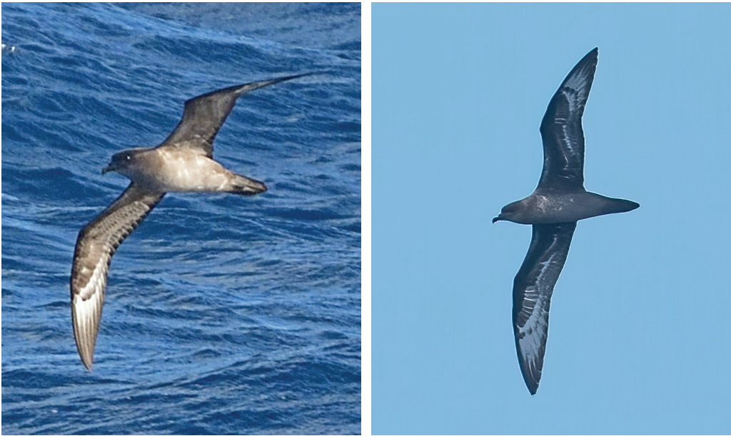
Figure 8 (left). Intermediate-morph Herald Petrel Pterodroma heraldica , 1.5–3.0 miles off east coast of Ua Pou, Marquesas Islands, French Polynesia, South Pacific, 5 October 2021; breast to undertail-coverts darkish with a quite clear ghosting of light-morph plumage (e.g., clearly delineated border between darker upper breast and paler lower breast). Multiple photographs were checked to eliminate the possibility that this is an effect of lighting (cf. Fig. 9). (Shoko Tanoi)