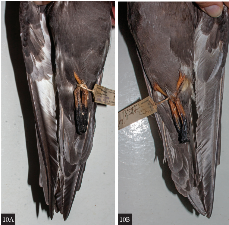
Figure 10A–B. Dark-morph Herald Petrel Pterodroma heraldica (Fig. 10A), Ducie Atoll, Pitcairn Islands, South Pacific (AMNH 191592, also Figs. 4D, 5–6); Henderson Petrel P. atrata (Fig. 10B, also Fig. 5), Henderson Island, Pitcairn Islands, South Pacific (AMNH 191753). Note, dark-morph Herald Petrel shows a white tongue basally on inner web of underside to primaries (only p10 visible here) and white basally in greater primary-coverts (outermost few visible here), both of which are dark in Henderson Petrel (though white basally on greater primary-coverts can be just visible; as here, be aware of light reflecting off the underside of the primaries)