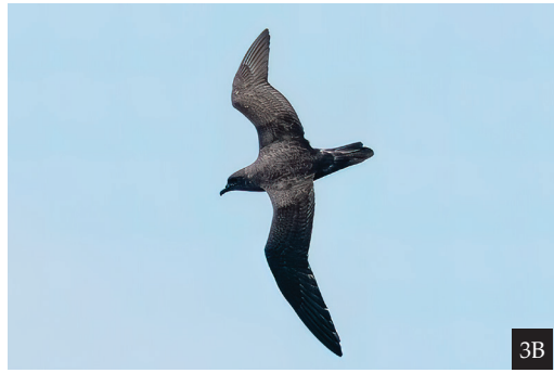
Figures 3A–B. Dark-morph Herald Petrels Pterodroma heraldica , 1.5–3.0 miles off east coast of Ua Pou, Marquesas Islands, French Polynesia, South Pacific, 3 and 5 October 2021 respectively; note slight variation in dorsal coloration, though true colour may be affected by lighting and feather wear (Fig. 3A Mike Danzenbaker, Fig. 3B Kirk Zufelt)