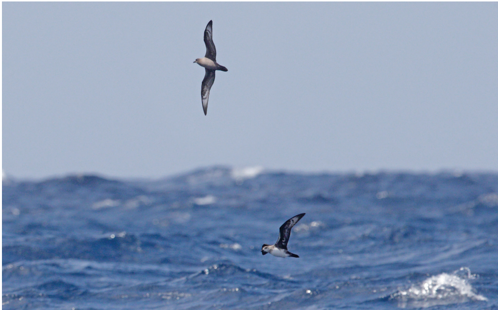
Figure 1. Light-morph (bottom) and dark-morph (top) Herald Petrels Pterodroma heraldica , c.1.5 miles off east coast of Ua Pou, Marquesas Islands, French Polynesia, South Pacific, 5 October 2021; the dark morph shows the same basic underwing pattern as the light morph, whilst Fig. 2D shows the same dark morph (Mike Danzenbaker)

due to a lack of confirmatory photographs, although they stated that ‘At-sea observations indicate that, unlike Henderson Petrel, some presumed dark-morph Heralds have white underwing primary flashes, like light-morph Herald, and a greyish ground colour to the plumage (H. Shirihai, pers. comm.).’ Bailey et al. (1989), Marchant & Higgins (1990) and Harrison et al. (2021) illustrated this plumage, but Bailey et al. did not distinguish Henderson Petrel from Herald Petrel and presented both underwing plumages as variation within Herald Petrel.