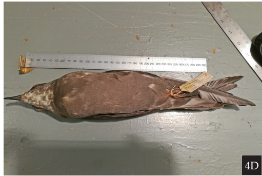
Figures 4A–D. Dark-morph Herald Petrel Pterodroma heraldica specimens at American Museum of Natural History (AMNH). Figure 4A. AMNH 194339 (top), AMNH 194338 (bottom), Ua Pou, Marquesas Islands, South Pacific, 14–15 September 1922. Figure 4B. AMNH 191756, Ducie Atoll, Pitcairn Islands, South Pacific, 30 March 1922. Figure 4C. AMNH 191770, Ducie Atoll, Pitcairn Islands, South Pacific, 30 March 1922. Fig. 4D. AMNH 191592, Ducie Atoll, Pitcairn Islands, South Pacific, 20 March 1922 (also shown in Figs. 5, 6 and 10)

one bird at sea (Fig. 8). General plumage In all respects, the palest intermediates approach light morph, and the darkest approach dark morph. Lower breast to undertail-coverts There is a gradation in plumage from dusky (AMNH 191366, Fig. 6) to darkish (AMNH 191642, Fig. 5), and in between (Fig. 8). The key difference from light morph is that the breast to undertail-coverts are at least wholly dusky (Fig. 6); and from dark morph this area manifests reasonably clear ghosting of light-morph plumage, with a relatively clear border between the dark upper breast and paler lower breast; Fig. 8).