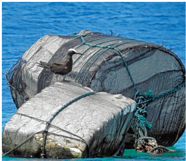
Figure 10. Black Noddy Anous minutus , off Rani, 6 August 2015

Status Occasional visitor. Seasonally common in New Guinea waters (Beehler & Pratt 2016); recently found breeding on the Hermit Islands (Bishop & Hacking 2020). 6 August 2015: an adult photographed off Rani (N. Voaden, eBird checklist S24512191; Fig. 10).