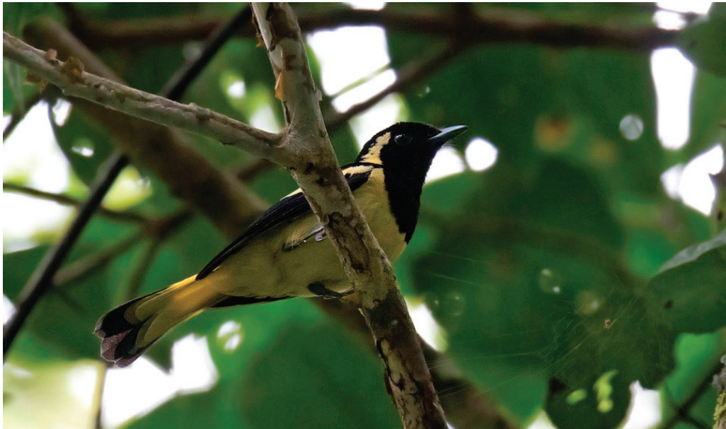
Figure 13. Male Biak Monarch Symposiachrus brehmii , Biak, 5 July 2017