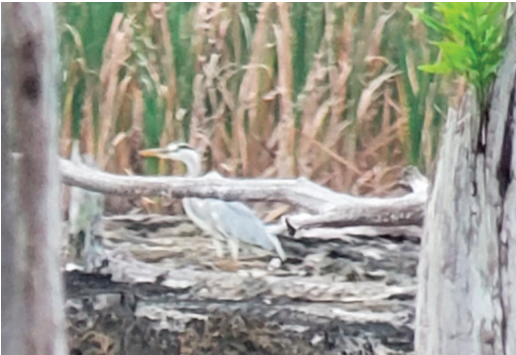
Figure 7. Grey Heron Ardea cinerea , Biak, 26 June 2019

Status Vagrant. The first documented record for New Guinea (see Beehler & Pratt 2016, Mayr 1941) and only the second in Australasia (Lane 2002). In the afternoon of 26 June 2019 an adult in non-breeding plumage was photographed at the tsunami swamp (P. Chaon, eBird checklist S59271786; Fig. 7). The nearest documented records are from Sumba (Coates & Bishop 1997) and Flores (van Balen & Irawan 2014) in the western Lesser Sundas of Indonesia.