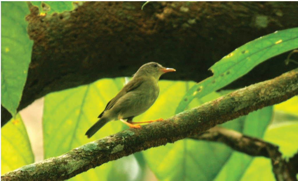
Figure 14. Biak Leaf Warbler Seicercus misoriensis , Biak, November 2010; note the lack of an obvious pale supercilium, dull coloration and, especially, the relatively long flesh-coloured bill and brightly coloured legs

Status Endemic species. Obtained by two collectors but not Ripley (Mayr & Meyer de Schauensee 1939). Seen by very few visitors although eBird records indicate that since 2018 it has been regularly encountered in forest at Warafri in south-east Biak; Gibbs (1993) saw it near Korrido, Supiori, in 1991. The species has a notably long bill and legs, both of which are strikingly coloured (Fig. 14); the difference in biometrics from other leaf warbler taxa presumably relates to a difference in behavioral traits, which further study should seek to elucidate.