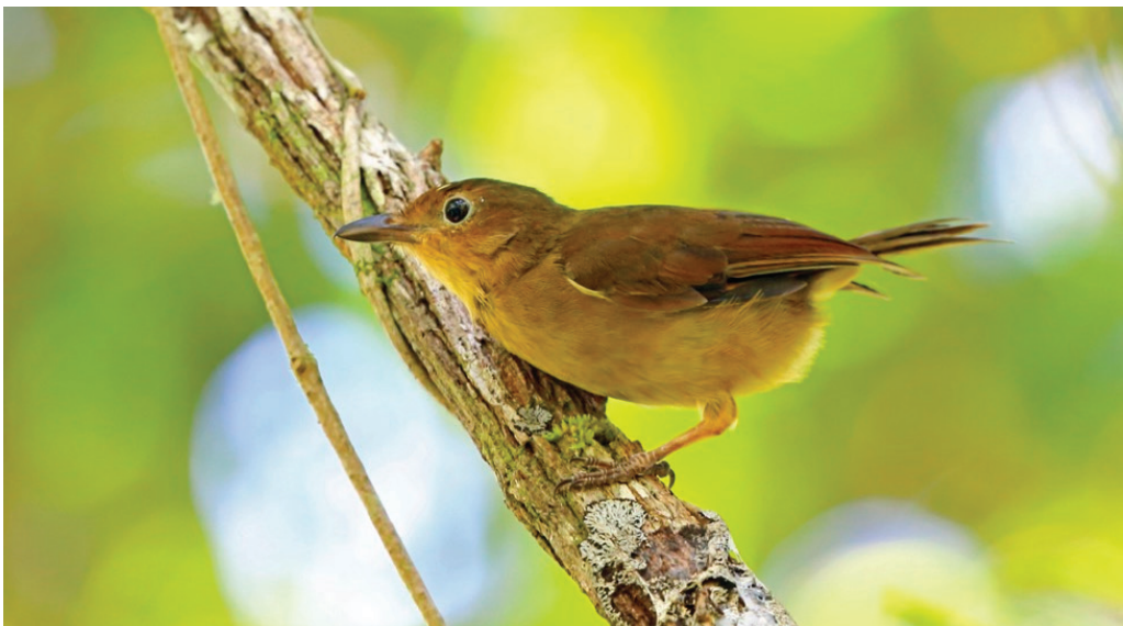
Figure 12. Little Shrikethrush Colluricincla megarhyncha , Biak, 5 July 2017

Status Endemic subspecies (Fig. 12). Widespread and common in tall secondary woodland, selectively logged and primary forest, from sea level to 488 m (Mayr & Meyer de Schauensee 1939; Supiori).