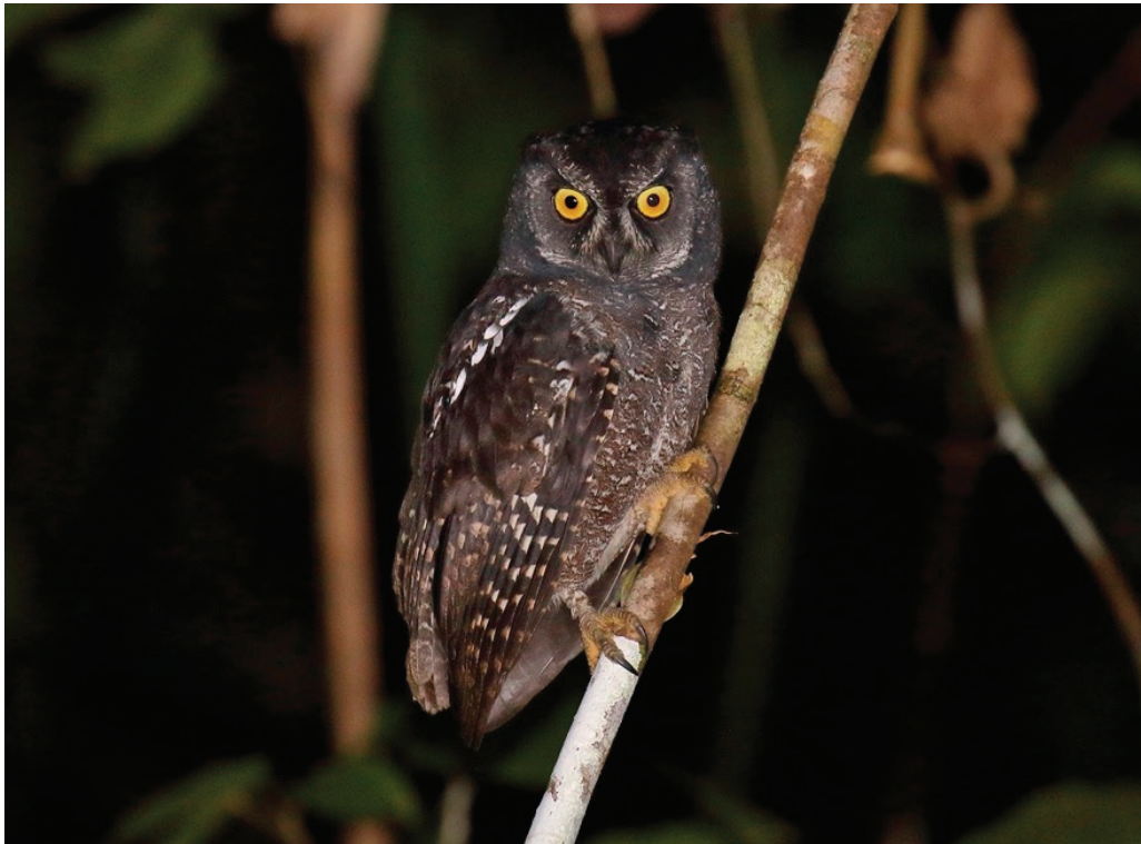
Figure 11. Biak Scops Owl Otus beccarii , Biak, 5 July 2017

Status Endemic species. The holotype, a male, was collected by Beccari in 1875 (Salvadori 1875). It was not recorded again until 1937 when Ripley obtained a pair from 'a heavy vine-covered tree in deep forest' near Korrido in southern Supiori (Mayr & Meyer de Schauensee 1939). These three are the only specimens. During 1982 KDB heard it calling at several locations from the vicinity of Kuneff, to his camp at c.305 m. Local informants at Kuneff appeared to be quite familiar with the species. Not recorded again until 1997 when SvB & B. M. Beehler heard one in and around Biak Utara Reserve. The species is specially sought by most visitors to the island and, with the aid of sound recordings of its voice, has been found, contrary to earlier perceptions, to be widespread and fairly common in remaining tall forest and mature secondary forest throughout southern Biak (Fig. 11). However, it is apparently absent from heavily degraded forest and secondary woodland. The northern two-thirds of Biak and most of Supiori are virtually unsurveyed, but the