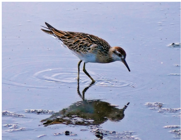
Figure 9. Sharp-tailed Sandpiper Calidris acuminata , Biak, November 2017

Status Palearctic migrant. Common passage migrant in New Guinea (Bishop 2006). Recorded