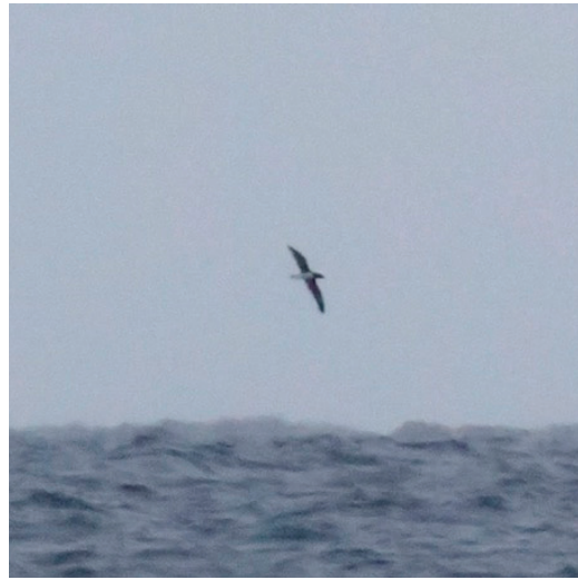
Figure 5. Tahiti Petrel Pseudobulweria rostrata or Beck's Petrel P. becki , between Biak and Numfor, 5 July 2017

Status Regular visitor? Although widespread in the tropical and subtropical Pacific and regularly recorded in waters immediately north of Papua New Guinea, there are few records from adjacent Indonesian New Guinea seas (Beehler & Pratt 2016; KDB). 24 August 2008: A. Whitlock (eBird checklist S48329087) noted 15, mostly dark morph, off southern Biak. KDB (together with J. Diamond) observed small numbers in the Raja Ampat Islands during January 1986 and October 2017; furthermore, on 17 November 2016 he noted c.60 off the north coast of Batanta, Raja Ampat Islands, and in September 1990 he saw small numbers off the north coast of the Vogelkop. These observations indicate that the species regularly occurs further west in northern New Guinea waters than previously surmised.