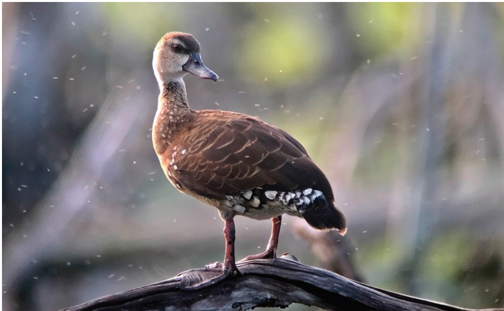
Figure 3. Spotted Whistling Duck Dendrocygna guttata , Biak, 14 November 2018

Breeding July 2007: M. Halaouate ( in litt. 2021) observed juveniles with adults on a river near Wari adjacent to Korim Bay. A. Walker ( in litt. 2021) noted that the two he photographed (Fig. 3) behaved as if they had a nest.