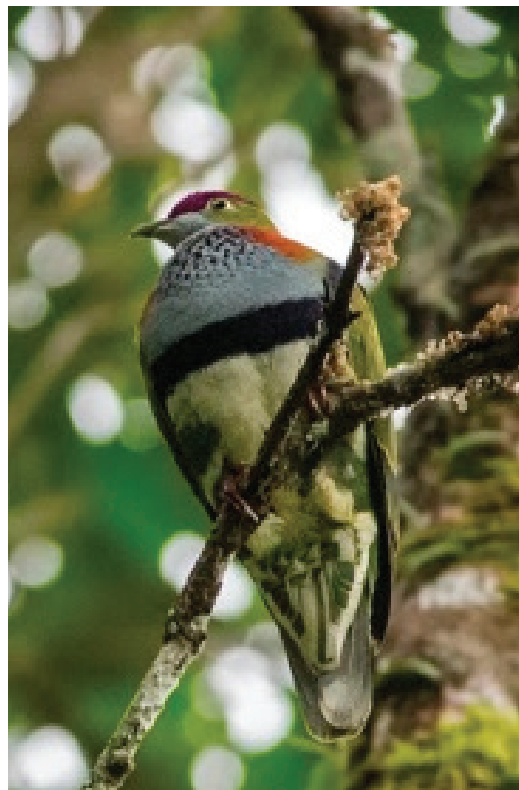
Figure 4. Superb Fruit Dove Ptilinopus superbus , Biak, 8 September 2019

Status Resident. First recorded on Biak in December 1962 (King 1979). Thereafter few records until the early 1990s when greater familiarity with the species' vocalisations improved visitors' ability to detect it. We recorded several on most visits. That this species has only recently been found on Biak and was not taken by any collectors suggests it may be a latter-day colonist, as this dove was obtained by early collectors such as A. A. Bruijn and O. Beccari on Numfor and Yapen (Salvadori 1880–82) and repeatedly recorded thereafter, especially on Yapen (Diamond & Bishop 2020). The bird in Fig. 4 has a grey, rather than purplish, breast thereby confirming that the Biak population belongs with the nominate subspecies as expected.