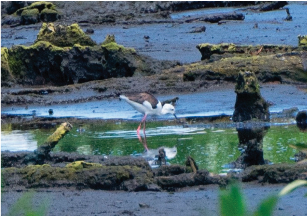
Figure 8. Black-winged Stilt Himantopus himantopus , Biak, 24 September 2019

Status Vagrant. First documented record for Australasia (Beehler & Pratt 2016, Menkhorst et al. 2017). 24 September 2019: an adult male (all-white head) first seen by D. Ashdown and photographed by P. Lansley (Fig. 8), feeding on mudflats in the tsunami swamp. It lacked the black on nape of adult Pied Stilt H. leucocephalus or browner wings with pale fringes to the primaries and coverts of young Pied Stilt, which do have white heads. It lacked the broad white mantle and back of Banded Stilt Cladorhynchus leucocephalus (P. Lansley, eBird checklist S64696799). Widespread throughout the Old World, Black-winged Stilt winters east and south to Borneo (Eaton et al. 2021) and the Philippines (Dickinson et al. 1991).