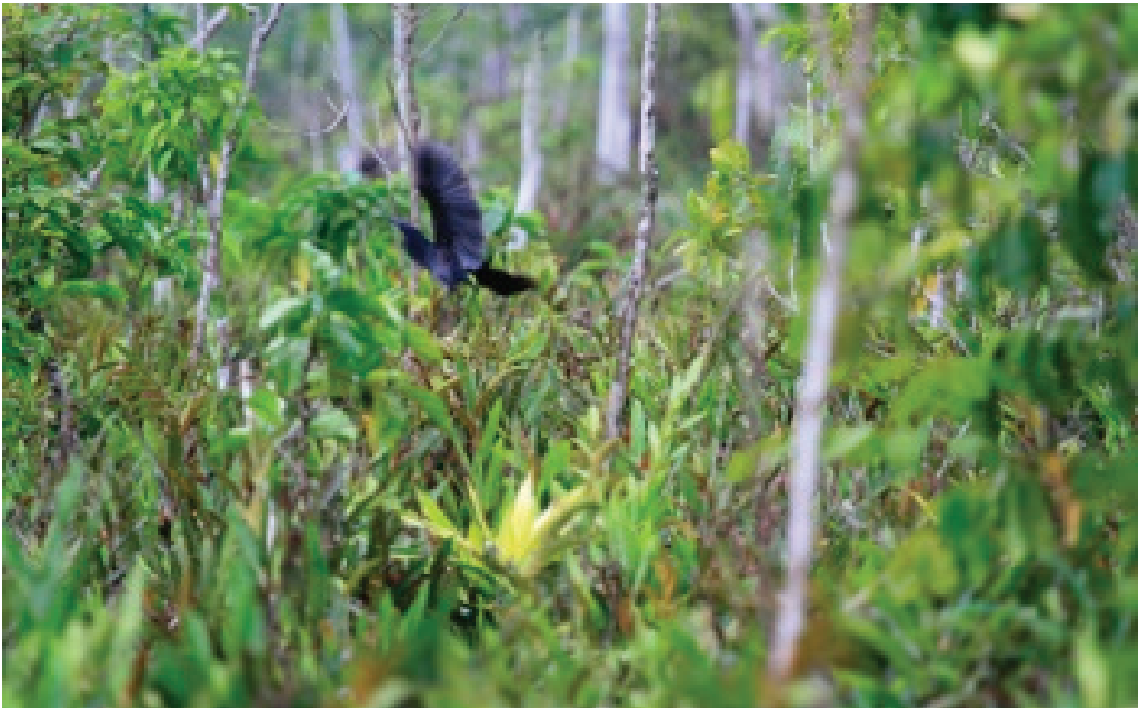
Figure 6. Melanistic Black Bittern Ixobrychus flavicollis , Biak, October 2012

(Fig. 6) in the tsunami swamp (F. Antram, eBird checklist S98647576); 5 August 2018: one at the same site (S. Lorenz, eBird checklist S47661085). KDB in Beehler & Pratt (2016) was incorrect to assert that there is at least one specimen from Biak.