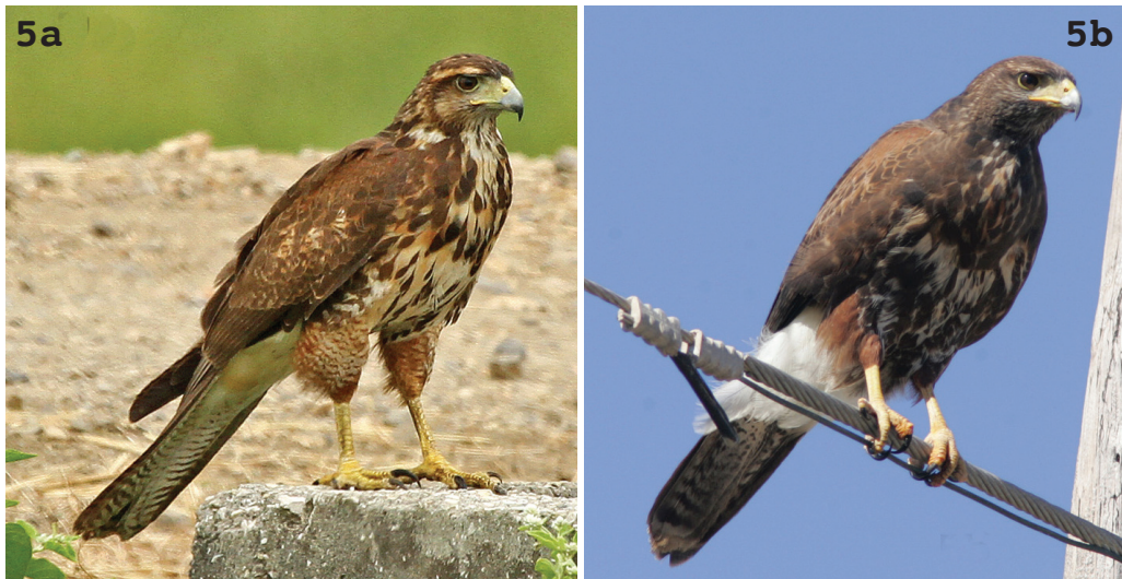
Figure 5a. Juvenile Bay-winged Hawk Parabuteo u. unicinctus (left, Ecuador, August 2010); 5b. juvenile Harris's Hawk P. u. harrisi (right, Texas, December 2010); note differences in markings on underparts, head and tarsal feathers.

Juvenile plumage. —Juvenile plumages of the two taxa are consistently and markedly different in multiple characters. Underparts. All juvenile unicinctus have buffy underparts with narrow dark streaking (Fig. 3a), whereas juvenile harrisi have dark underparts with white to buffy markings (Fig. 3c). Undertail. Juvenile unicinctus has the undertail whitish with narrow dark bands (Fig. 3a), whereas juvenile harrisi has a medium grey undertail with fewer and broader dark bands (Fig. 3c). Upperparts. Juvenile unicinctus has buffy markings on the upper back (Figs. 3b, 5a), not shown by any juvenile harrisi (Figs. 3d, 5b). Rufous markings on the upperwing-coverts are visible in juvenile harrisi (Figs. 3d, 5b), but the rufous area is smaller and less visible in unicinctus (Figs. 3b, 5a). Underwings. Underwing-coverts are mostly rufous on harrisi but mottled buffy and dark brown in unicinctus