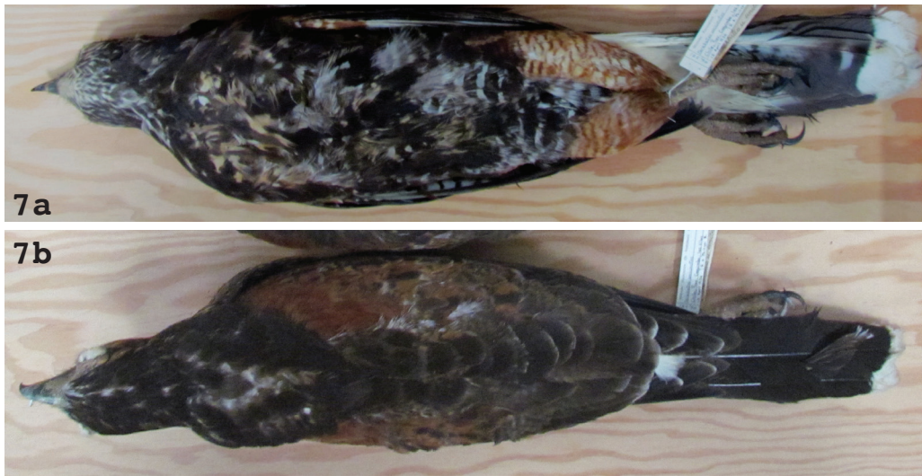
Figure 7. Basic III Bay-winged Hawk Parabuteo u. uncinctus at Western Foundation of Vertebrate Zoology, which showed two waves of primary moult (WFVZ 46385; Chile, August 1937) (top: ventral; below: dorsal); note similarity to Harris's Hawks P. u. harrisi in Fig. 3c–d