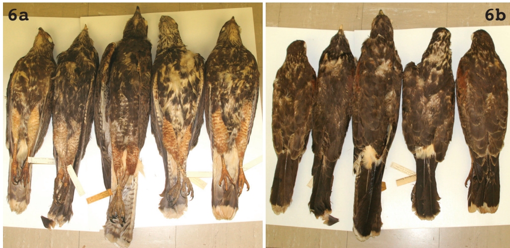
Figure 6. Basic II Bay-winged Hawks Parabuteo u. unicinctus in flight feather moult (National Museum of Natural History, Smithsonian Institution) (left: ventral; right: dorsal); four from Paraguay and one from Chile; note similarity to juvenile Harris's Hawks P. u. harrisi in Fig. 3c–d (W. S. Clark)