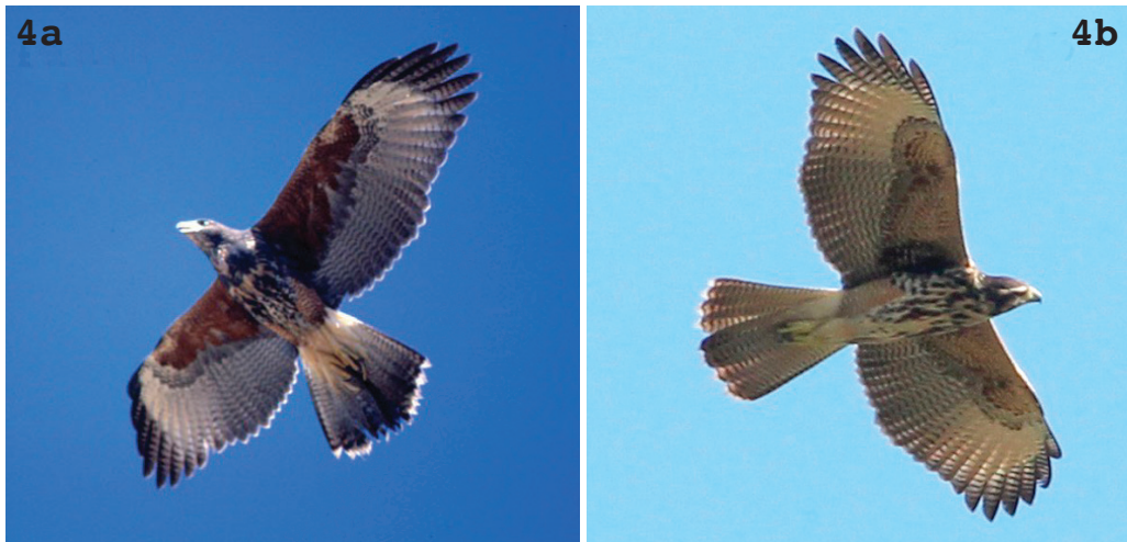
Figure 4a. Juvenile Harris's Hawk Parabuteo unicinctus harrisi (left, Texas, December 2005); vs. 4b. juvenile Bay-winged Hawk P. u. unicinctus in flight (right, Argentina, June 2019); note difference in markings on underparts and underwing-coverts.