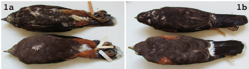
Figure 1a. Adult Bay-winged Hawk Parabuteo u. uncinatus at Carnegie Museum, Pittsburgh (CM P94603, Bolivia, August 1922; top in both images) vs. adult Harris's Hawk P. u. harrisi (CM P165789, Texas, December 1913; below); note differences in throat, underparts and tarsal markings (W. S. Clark)

Adult plumage. —Definitive Basic (adult) plumages of these taxa are similar, but all adults differ in several traits, namely throat markings, colour and markings on the undersides of the remiges, markings on the belly and breast, markings on the leg feathers, and extent of white at the base and tips of the rectrices (Figs. 1–2). Throat markings. All adult harrisi have an unmarked dark throat, whereas adult unicinctus almost always shows a variable amount of white streaking on the dark throat (Fig. 1). Underside of remiges. All adult harrisi have unmarked dark undersides to the remiges (Fig. 2b), whereas all adult unicinctus have whitish primaries with narrow dark bands and black tips on the outer ones, but many adult unicinctus have whitish secondaries with narrow dark bands (Fig. 2a), though some have darker secondaries with some narrow white bands (e.g., https://www.wikiaves.com/4185104 ). All adult unicinctus have a broad darker subterminal band on the secondaries