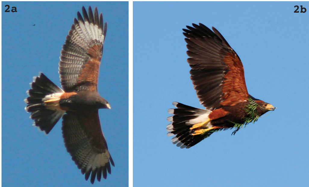
Figure 2a. Adult Bay-winged Hawk Parabuteo u. uncinatus (left, Venezuela, June 2006); vs. 2b. adult Harris's Hawk P. u. harrisi (right, Texas, April 2014); note differences in the colour and markings on the undersides of the remiges, and width of the white base and terminal tail-band (W. S. Clark)