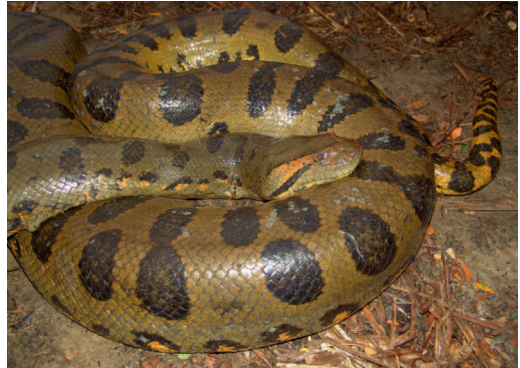
Figure 7. Eunectes murinus from Estado Apure, Venezuela.

Taxonomy. Originally described as Boa murina by Linnaeus. When Wagler (1830) described the genus Eunectes , B. murina became the type species. Aside from Stull (1935) resurrecting the old Linnaean name scytale to replace murinus , and the epithet