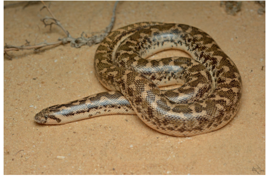
Figure 14. Eryx jaculus from Caesarea, Israel.

Type Specimen. Lectotype NRM Lin-12, an adult of unknown sex from Egypt. The holotype is likely lost (Kluge, 1993).