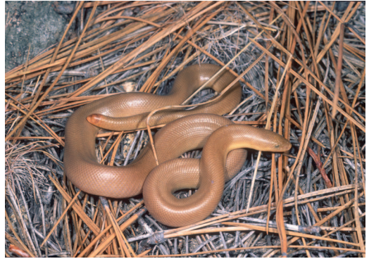
Figure 10. Charina bottae from Kern County, California.