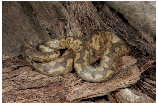
Figure 9. Candoia paulsoni mcdowellii from Milne Bay Province, Papua New Guinea.

Conservation Status. This subspecies has not been assessed, though it is likely persecuted (O'Shea, 1996).