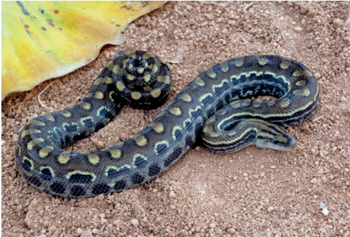
Figure 6. Epicrates crassus from Reserva Ecológica do IBGE, Brasília, Distrito Federal, Brazil.

Type Specimen. An adult, USNM 12413, from Gardosa, Río Paraná, Paraguay.