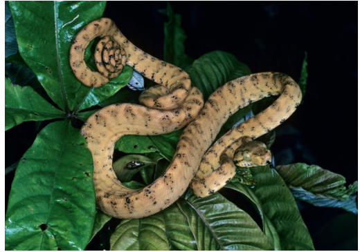
Figure 5. Corallus hortulanus from Pará, Brazil.

Taxonomy. Originally described as Boa grenadensis , Barbour (1935) subsequently relegated it to a subspecies of B. cookii ; meanwhile, Stull (1935) synonymized it with B. enydris cookii ; Barbour (1937) continued to recognize it as a subspecies of B. cookii . After Forcart (1951) untangled Boa , Constrictor , and Corallus and McDiarmid et al. (1996) did the same for C. enydris/hortulana , Henderson (1997) resurrected Corallus grenadensis to full species status. Recent molecular evidence (Colston et al., 2013; Reynolds et al., 2014) shows C. grenadensis