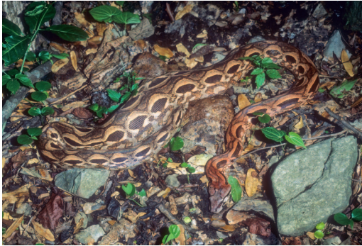
Figure 15. Acrantophis madagascariensis from Nosy Hara, Madagascar.

Acrantophis are not well characterized (Orozco-Terwengel et al., 2008).