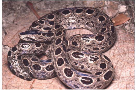
Figure 13. Ungaliophis continentalis from Chiapas, Mexico.

Distribution. Southern Nicaragua, Costa Rica, Panama to northwestern Colombia