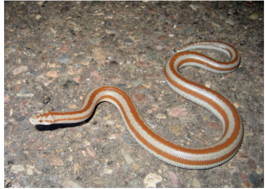
Figure 11. Lichanura trivirgata from Bahia Los Angeles, Mexico.