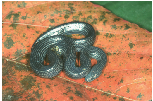
Figure 12. Exiliboa placata from Oaxaca, Mexico.

Taxonomy. Described as the type species ( E. placata ) in a new genus ( Exiliboa ) by Bogert (1968b). No subspecies are recognized.