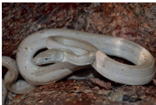
Figure 4. Chilabothrus argentum from Conception Island, Bahamas.