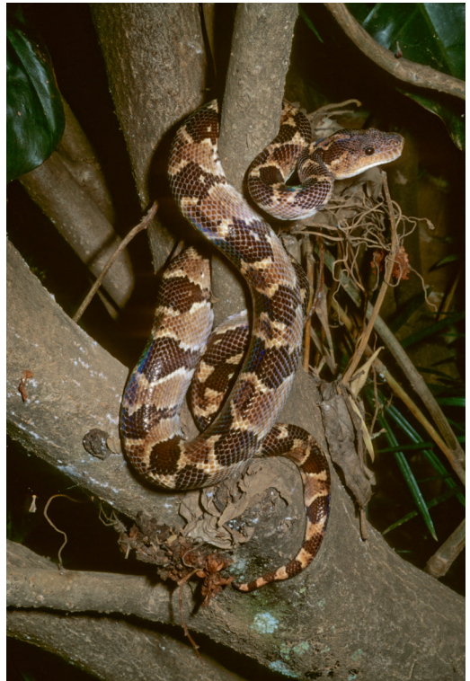
Figure 16. Sanzinia volontary from Tsingy de Bemaraha, Madagascar.

Despite some species of booids being among the most iconic of reptiles in general and perhaps including some of the most commercially sought-after species of snakes