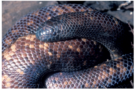
Figure 8. Calabaria reinhardtii , locality unknown (captive specimen).

Taxonomy. Described by Schlegel (1848) as Eryx reinhardtii , the type of the genus was given as Calabaria fusca Gray 1858. The genus was referred to as both Rhoptrura and Eryx in the 19th century until Boulenger (1893) stabilized the monotypic genus as C. reinhardtii . Kluge (1993) placed