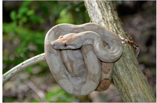
Figure 3. Boa imperator from Cayos Cochinos, Honduras.

Conservation Status. This taxon has not received an IUCN Red List assessment; it is, however, listed under CITES Appendix I