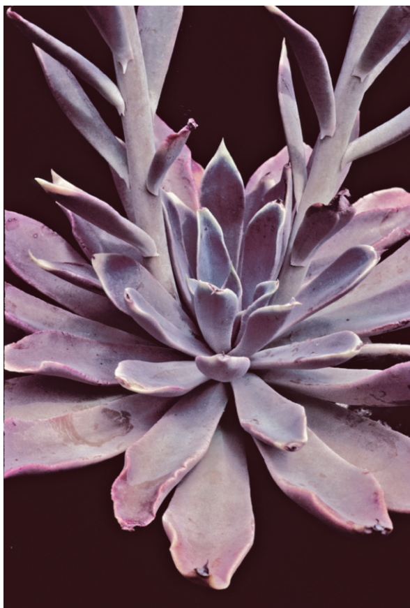
▼ The probable natural hybrid in cultivation.