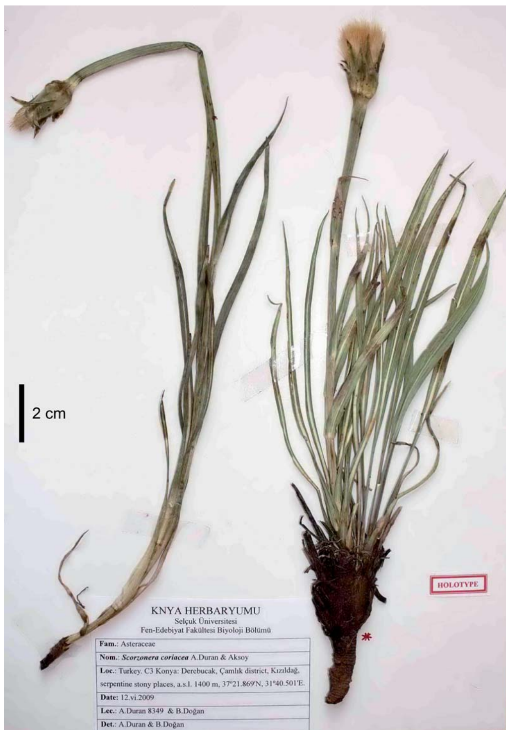
Fig. 1. – Holotype of Scorzonera coriacea A. Duran & Aksoy. [Duran 8349 & B. Doğan, KNYA]