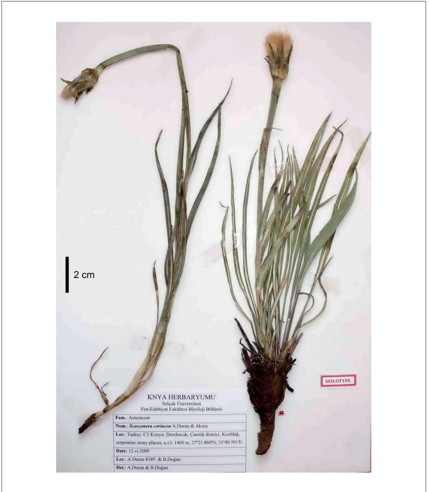
Fig. 1. – Holotype of Scorzonera coriacea A. Duran & Aksoy.