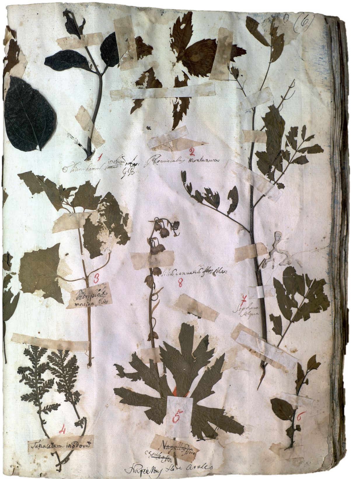
Fig. 3. – Sheet number 6 of the Cupani Herbarium.