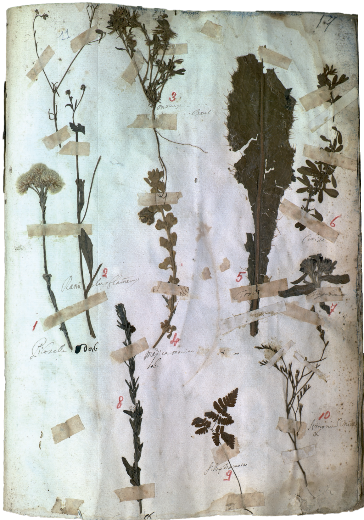
Fig. 6. – Sheet number 17 of the Cupani Herbarium.