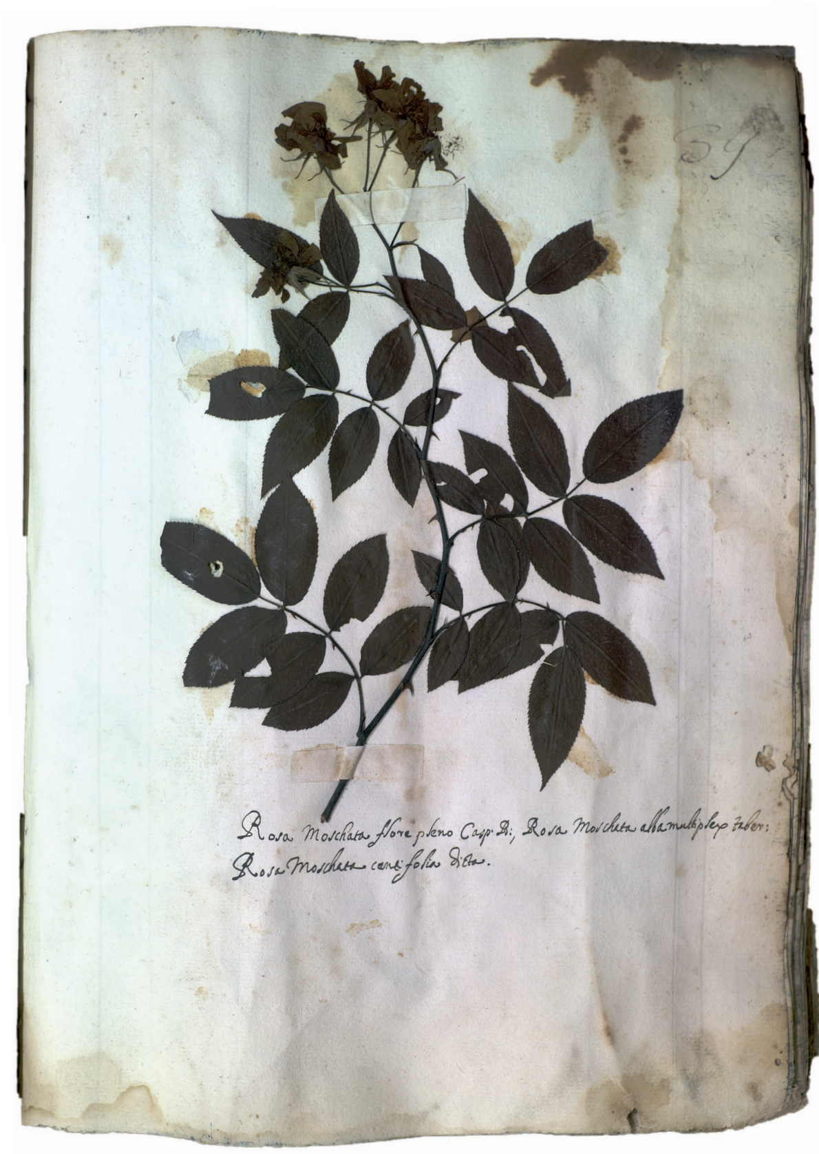
Fig. 5. – Sheet number 39 of the Cupani Herbarium containing one specimen of Rosa L. (Rosaceae).