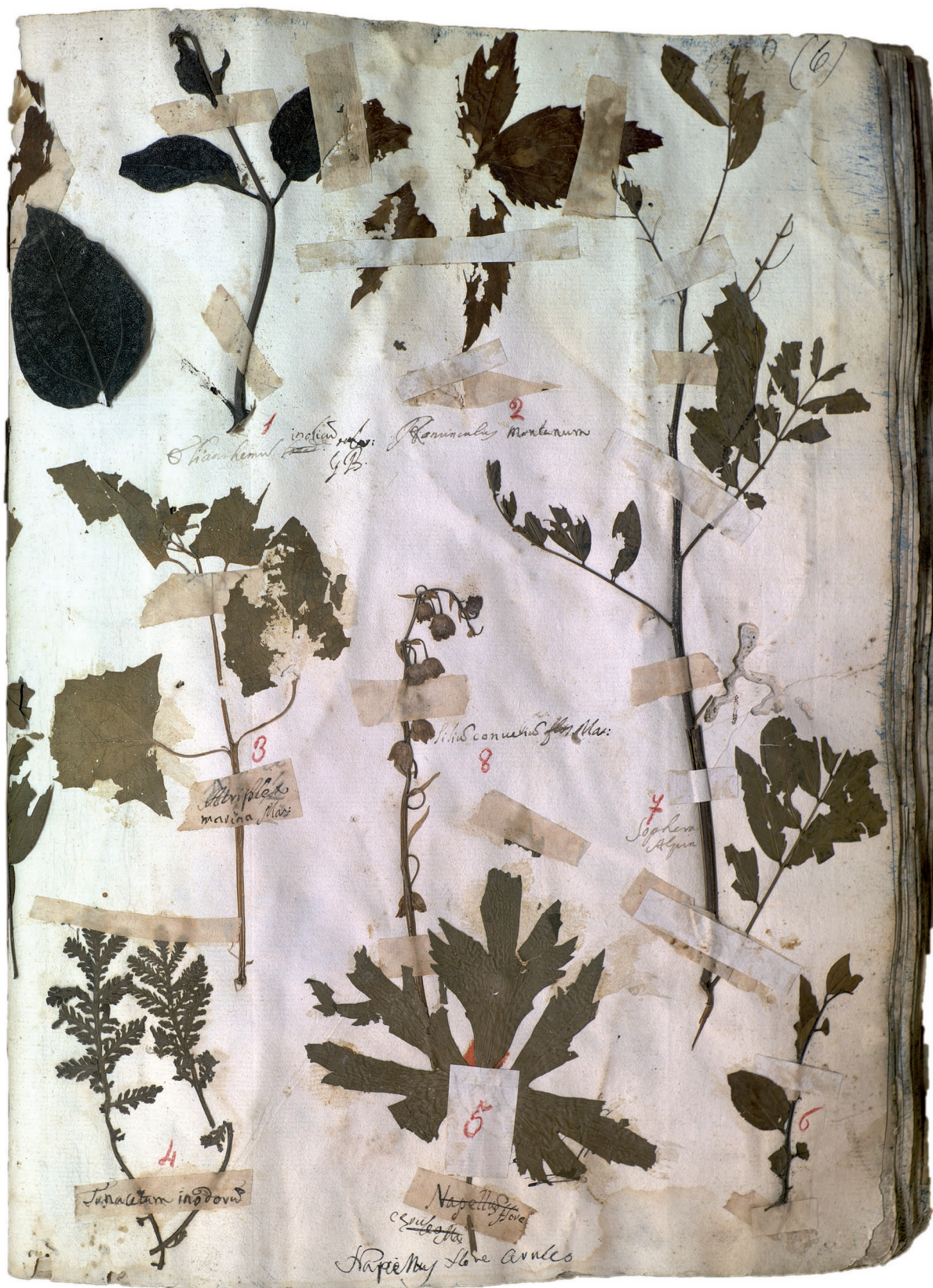
Fig. 3. – Sheet number 6 of the Cupani Herbarium.