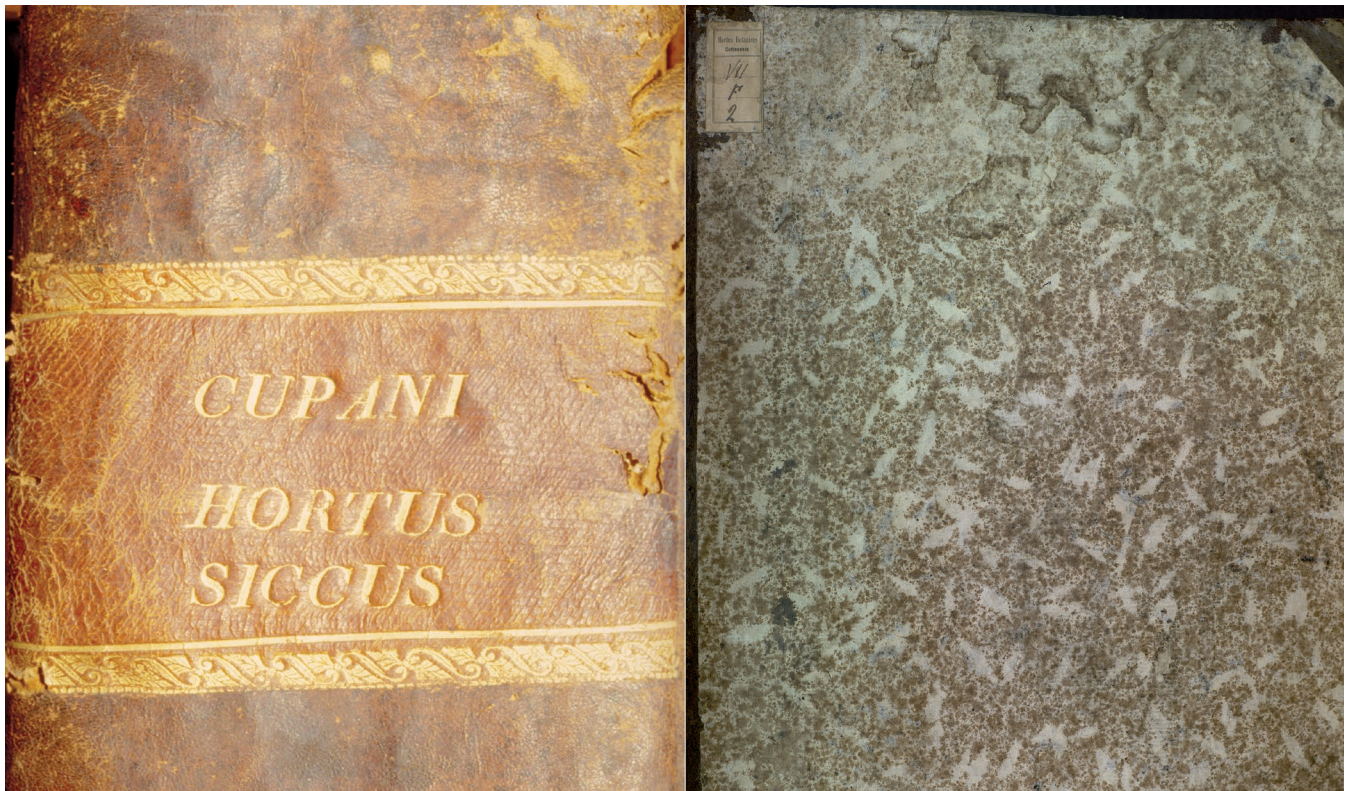
Fig. 1.—Spine and inventory label of the Cupani Herbarium.

cannot be equated with Linnaean binomials (genus, species). Cupani called his descriptions “polilogus”, i.e. sentences of a few words (CUPANI, 1692, 1695, 1696, 1697). His technique matched a simple requirement of synthesis. Instead, the Linnaean binomial represents a classification system allowing the identification of a genus and a species in a frame of reference (PULVIRENTI et al., 2015, in press).