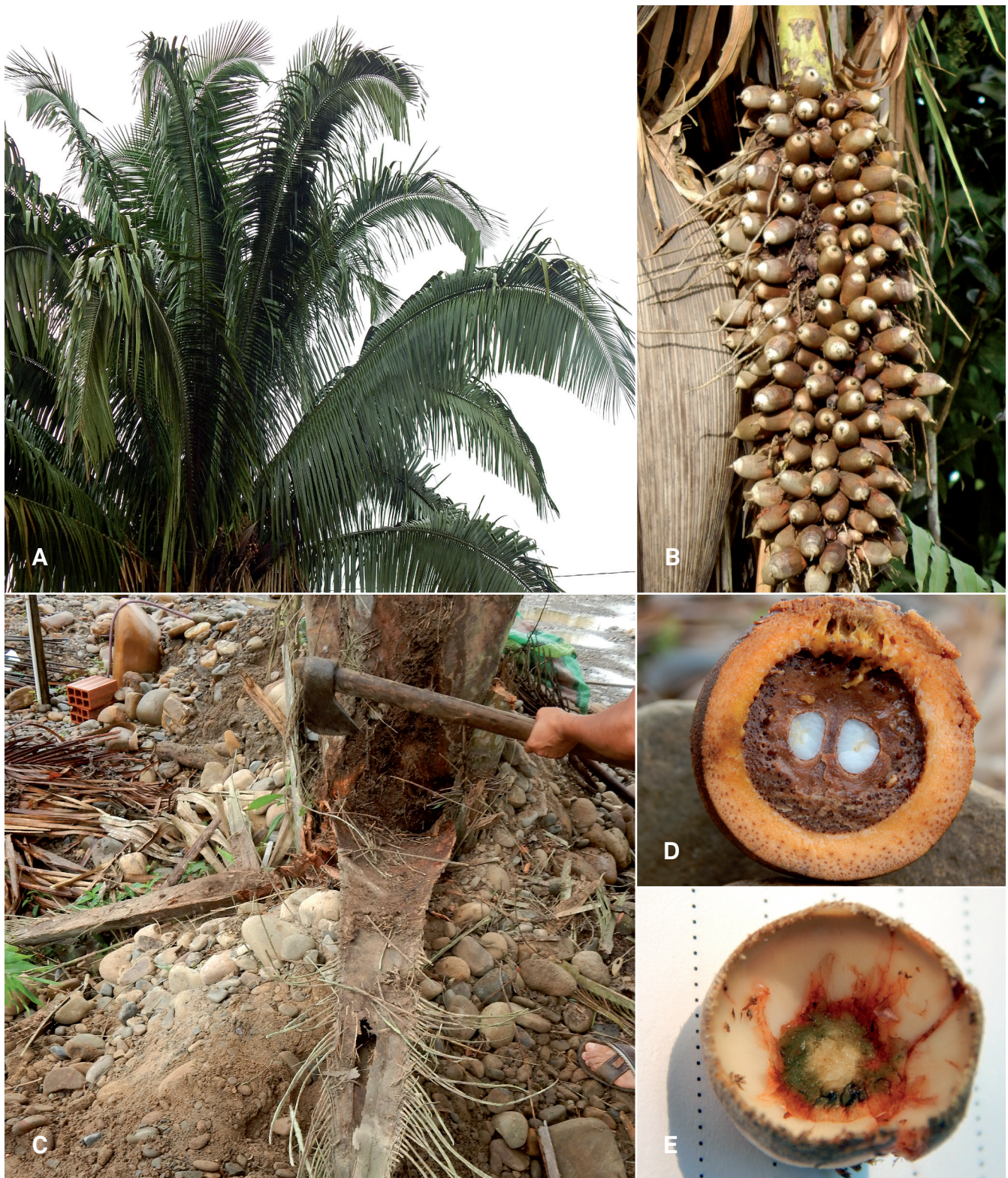
Fig. 2. – Attalea blepharopus Mart. A. Growth habit; B. Inflorescence at ripe stage; C. Fibrous margins of leaf base; D. Cross section of fruit showing two developing seeds; E. Staminodial ring adnate to corolla (removed from a fruit) appears densely ciliate in the margins.