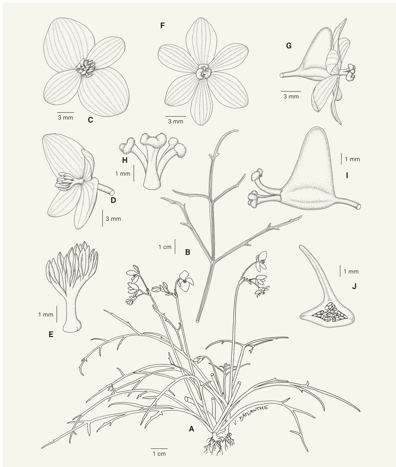
Fig. 2. – Begonia pteridoides Scherber. & Duruiss. A. Habit; B. Leaf, adaxial side; C. Male flower, front view; D. Male flower, side view; E. Androecium; F. Female flower, face view; G. Female flower, side view; H. Styles and stigmas; I. Ovary; J. Ovary cross-section. [Scherberich 1148, LYJB] [Drawing: Vanessa Damianthe]