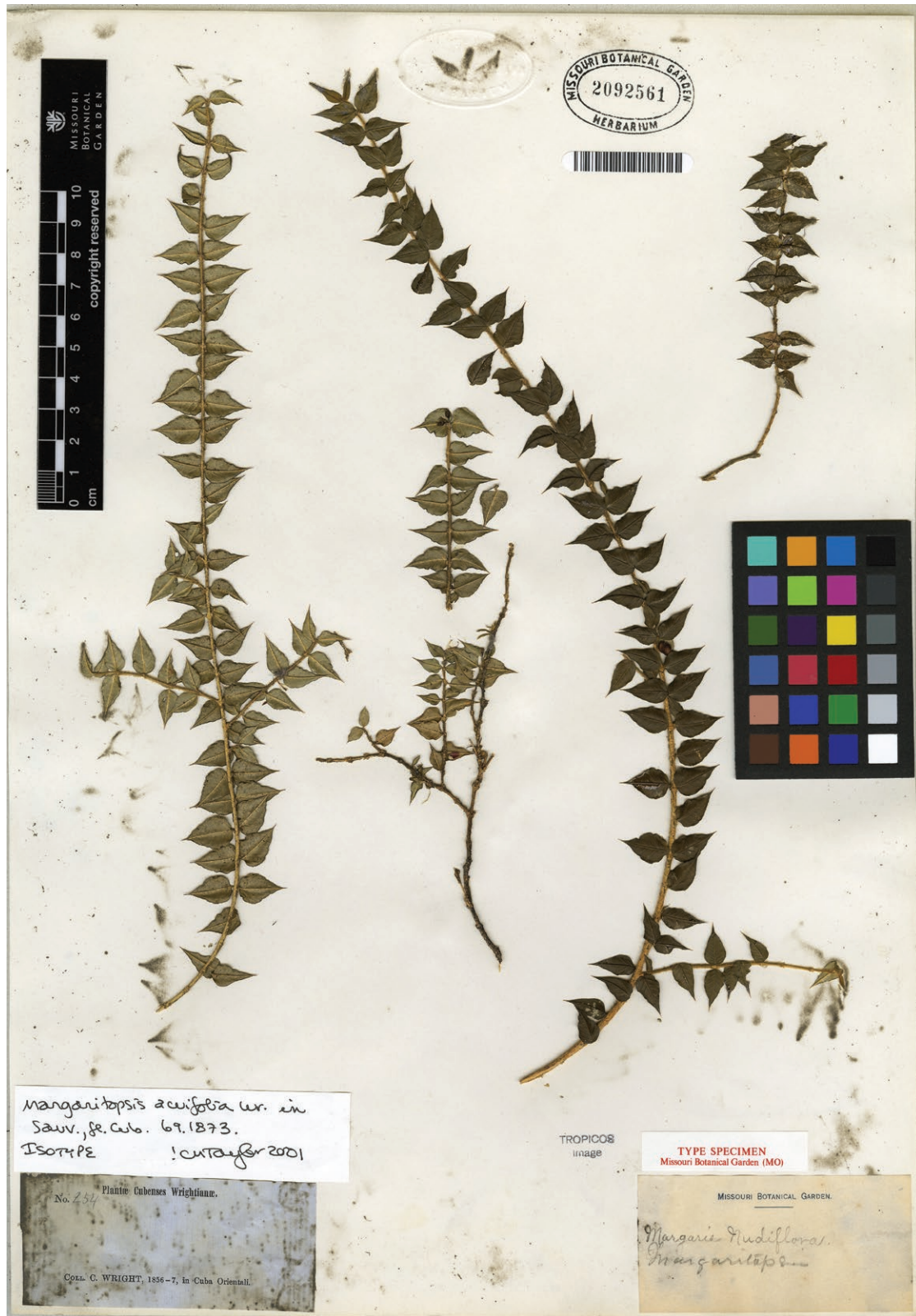
Fig. 2. – Isotype of Eumachia acuiifolia (C. Wright) Delprete & J.H. Kirkbr.