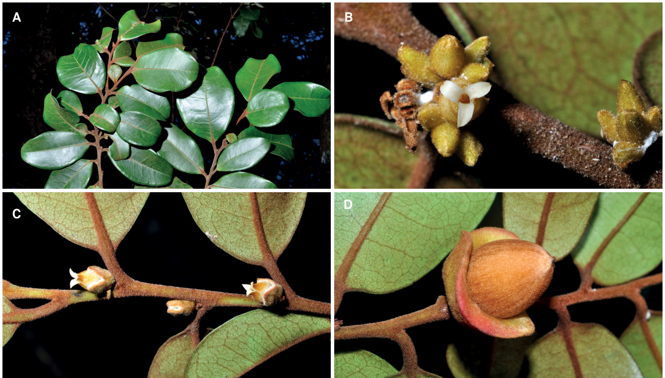
Fig. 5. - Diospyros rufotomentosa G.E. Schatz & Lowry. A. Upper leaf surfaces; B. Male flowers; C. Female flowers; D. Fruit. [A, D: Lowry & Schatz 7469; B: Lowry & Schatz 7470; C: Lowry & Schatz 7471]