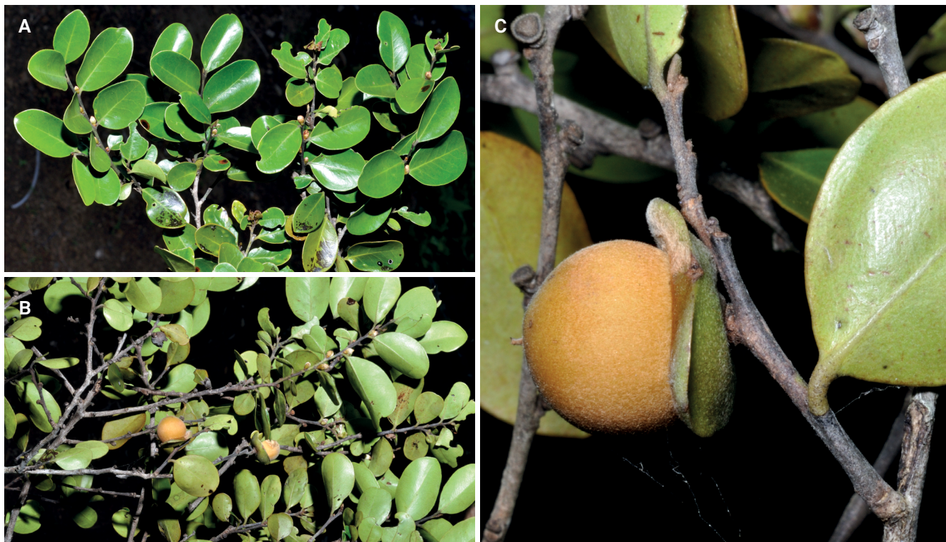
Fig. 2. - Diospyros hequetiae G.E. Schatz, Lowry & Fleurot. A. Upper leaf surfaces; B. Lower leaf surfaces, females flowers, and fruit; C. Fruit. [Lowry, Schatz & Fleurot 7460]