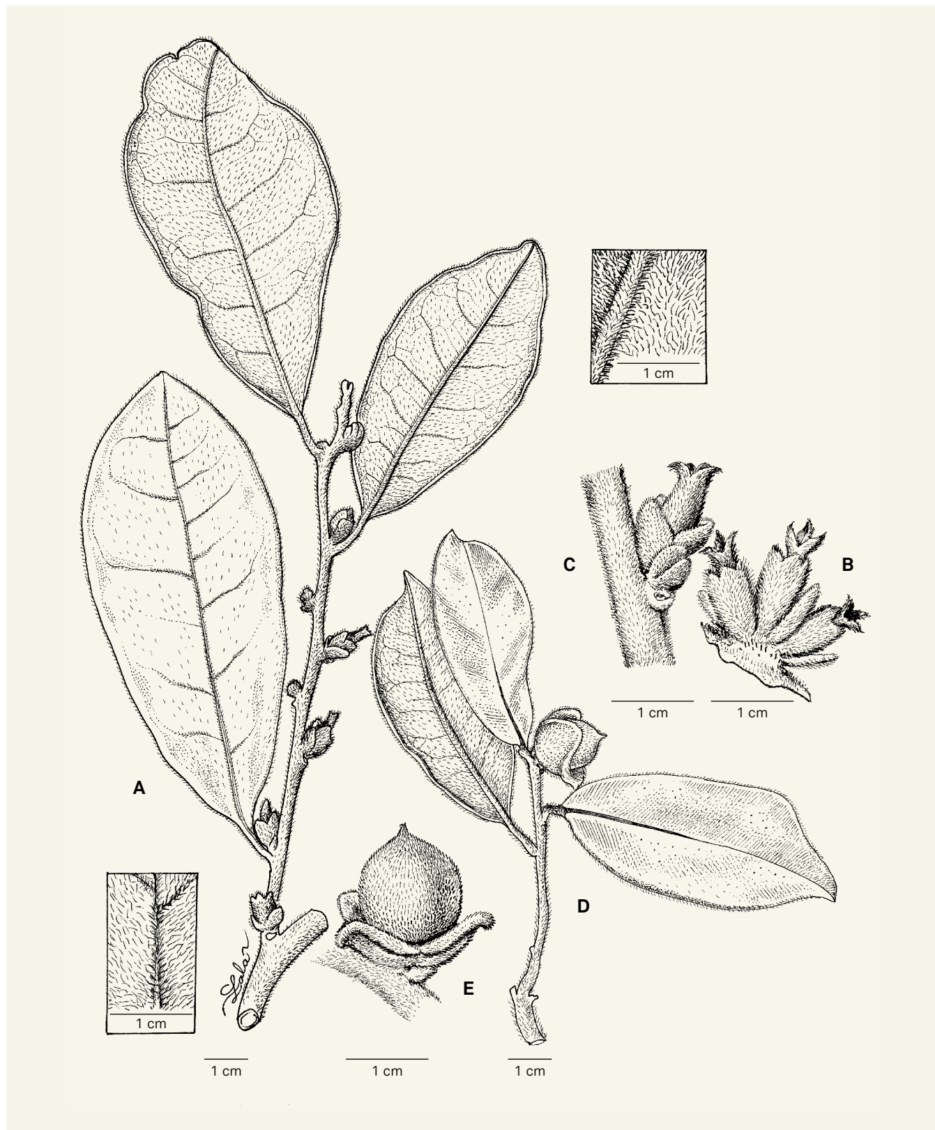
Fig. 4. - Diospyros rufotomentosa G.E. Schatz & Lowry. A. Female flowering branch; B. Male flowers; C. Female flower; D. Fruiting branch; E. Fruit. [A, C: Lowry & Schatz 7470, P; B: Lowry & Schatz 7471, P; D-E: Lowry & Schatz 7469, P] [Drawings: R.L. Andriamiarisoa]