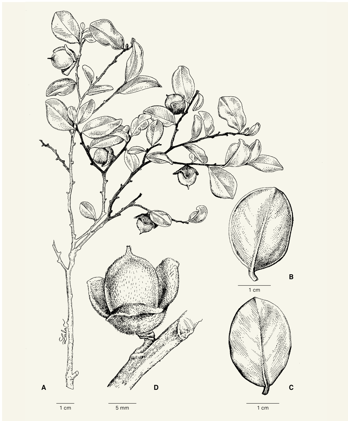
Fig. 1. - Diospyros hequetiae G.E. Schatz, Lowry & Fleurot. A. Fruiting branch; B. Lower leaf surface; C. Upper leaf surface; D. Fruit. [Lowry, Schatz & Fleurot 7460, P] [Drawings: R.L. Andriamiarisoa]