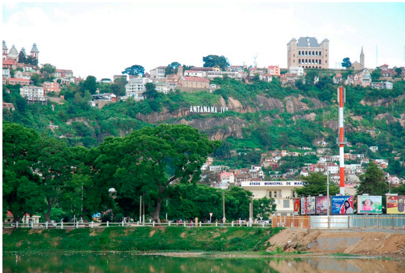
Fig. 2. – Inselberg in the capital Antananarivo with the “Palais de la Reine”.

rich in locally endemic species and possess more habitat specialists than similar habitats in most other tropical regions.