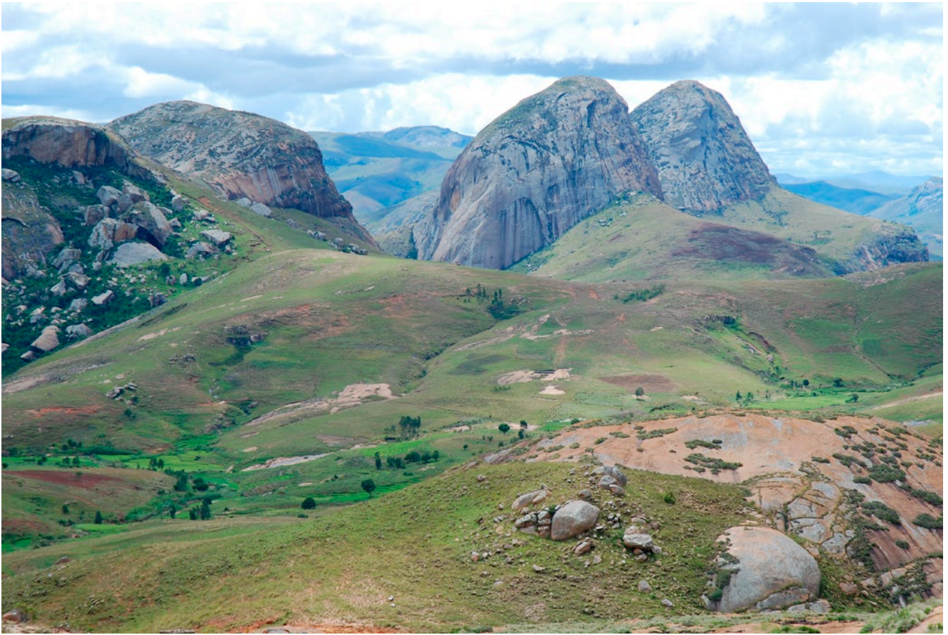
Fig. 1. – Inselberg landscape, near Ambalavao.