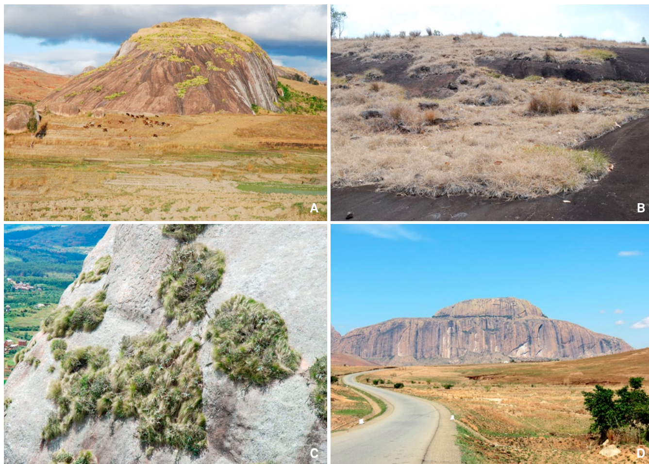
Fig. 6. – A. Inselberg, south of Anja Park (Tangorika) covered with Furcraea foetida (L.) Haw. (Asparagaceae); B. Mat with Styppeiochloa hitchcockii (A. Camus) Cope (Poaceae) near Angavokely; C. Mats formed by Coleochloa setifera (Ridl.) Gilly (Cyperaceae) and steep slopes, south of Fianarantsoa; D. General overview of "Bonnet du Pape, at Voatavo (Fig. 3: n° 26).

exceptions include those within certain National Parks such as Andringitra and Marojejy. In unprotected areas globally, inselbergs often support the last remnants of natural vegetation in a given area. While certain types of human use of inselbergs have occurred for generations and do not seem to have caused severe damage, in recent times human impact appears to have become by far more destructive resulting in steadily growing pressure on these areas, and today most inselbergs in Madagascar exhibit detrimental human impacts. These include: the over-collection of certain useful species which impacts local populations or even threatens local endemics with extinction; use of inselbergs for grazing cattle and goats; uncontrolled bush-fires, usually resulting from the widespread burning of grasslands for agriculture, that may significantly impact the population of individual species and which are also responsible for habitat degradation or destruction as a whole (see WHITMAN et al., 2011 for a study of the influence of fire and water availability