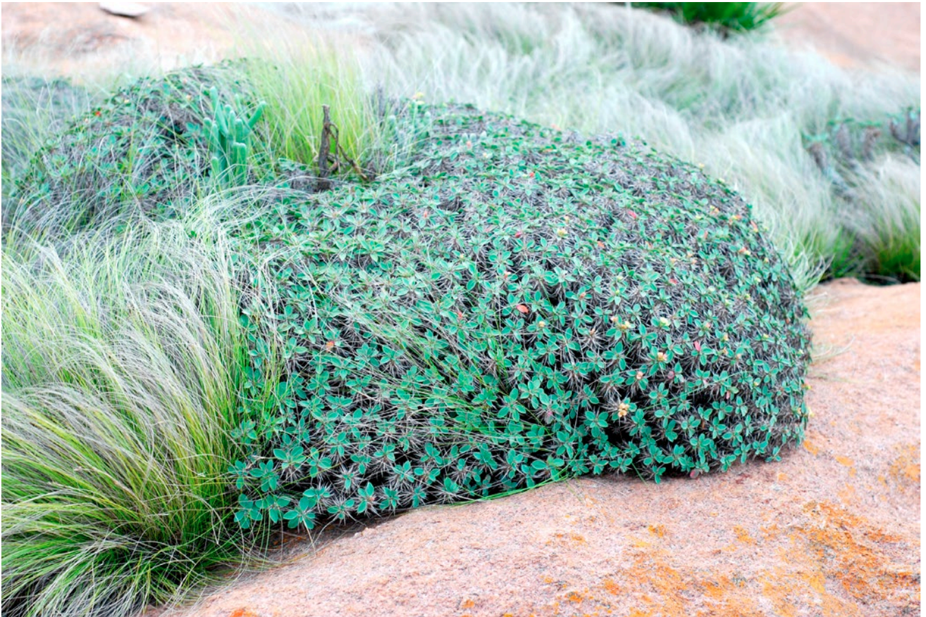
Fig. 4. – Euphorbia horombensis Ursch & Leandri ( Euphorbiaceae ) a succulent on open rocks at Vohitsanavo inselberg, Anja Park (Fig. 3: n° 23). [Razafindraibe et al. 278]

(B.S. Williams) Schltr., Angraecum pseudofilicornu , Oeceoclades calcarata (Schltr.) Garay & P. Taylor, Sobennikoffia humbertiana ) were present.