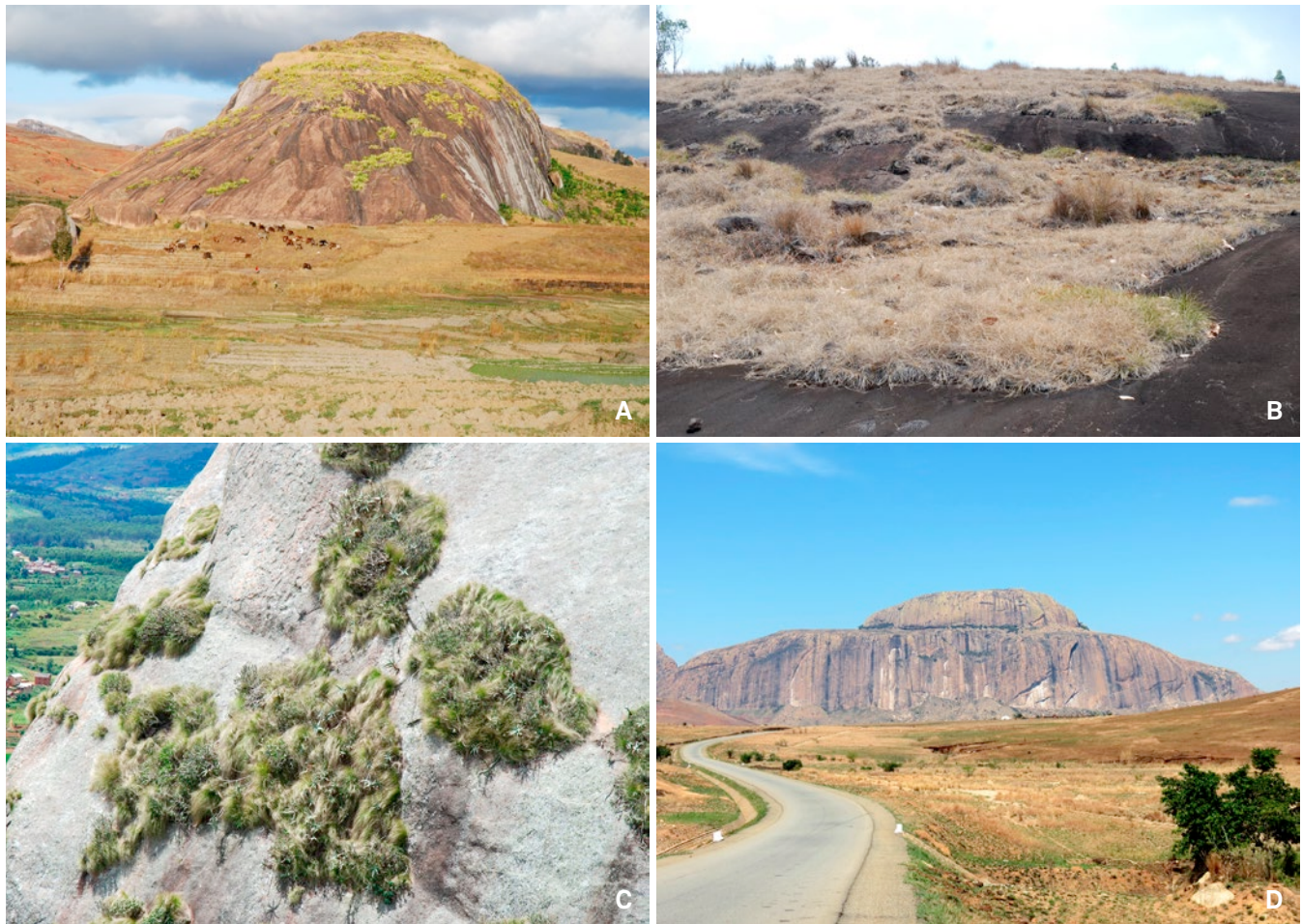
Fig. 6. – A. Inselberg, south of Anja Park (Tangorika) covered with Furcraea foetida (L.) Haw. (Asparagaceae); B. Mat with Stypeiochloa hitchcockii (A. Camus) Cope (Poaceae) near Angavokely; C. Mats formed by Coleochloa setifera (Ridl.) Gilly (Cyperaceae) and steep slopes, south of Fianarantsoa; D. General overview of “Bonnet du Pape, at Voatavo (Fig. 3: n° 26).

exceptions include those within certain National Parks such as Andringitra and Marojejy. In unprotected areas globally, inselbergs often support the last remnants of natural vegetation in a given area. While certain types of human use of inselbergs have occurred for generations and do not seem to have caused severe damage, in recent times human impact appears to have become by far more destructive resulting in steadily growing pressure on these areas, and today most inselbergs in Madagascar exhibit detrimental human impacts. These include: the over-collection of certain useful species which impacts local populations or even threatens local endemics with extinction; use of inselbergs for grazing cattle and goats; uncontrolled bush-fires, usually resulting from the widespread burning of grasslands for agriculture, that may significantly impact the population of individual species and which are also responsible for habitat degradation or destruction as a whole (see WHITMAN et al., 2011 for a study of the influence of fire and water availability