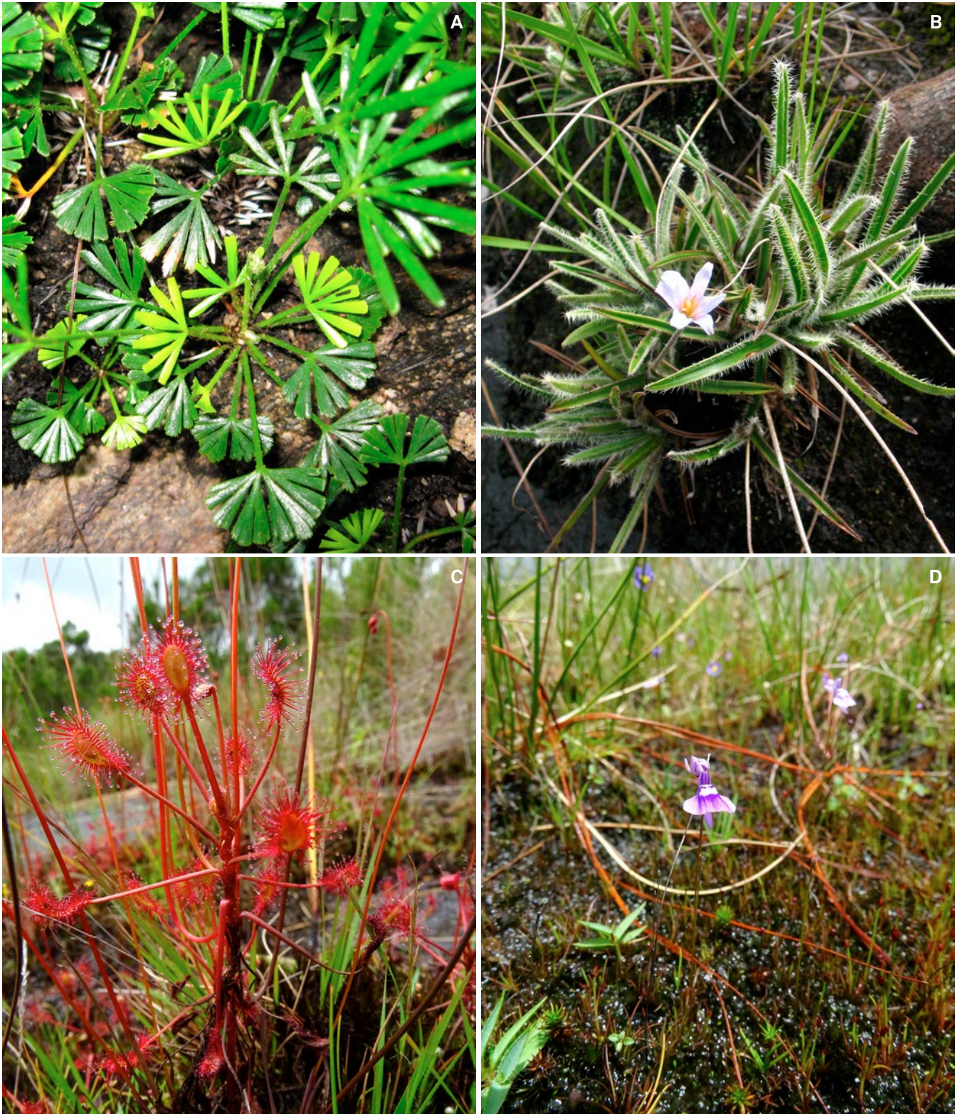
Fig. 5. – A. Actiniopteris dimorpha Pic. Serm. ( Pteridaceae ) a desiccation-tolerant species of fern at Vohidava, Ihoay; B. Xerophyta sp. ( Velloziaceae ) near Anjoman'Akona, south of Ambositra; C. Drosera madagascariensis DC. ( Droseraceae ); D. Utricularia sp. ( Lentibulariaceae ). [A: Razafindraibe et al. 300; B: Rakotoarivelo et al. 287; C: Rabarimanarivo et al. 745; D: Rabarimanarivo et al. 705]