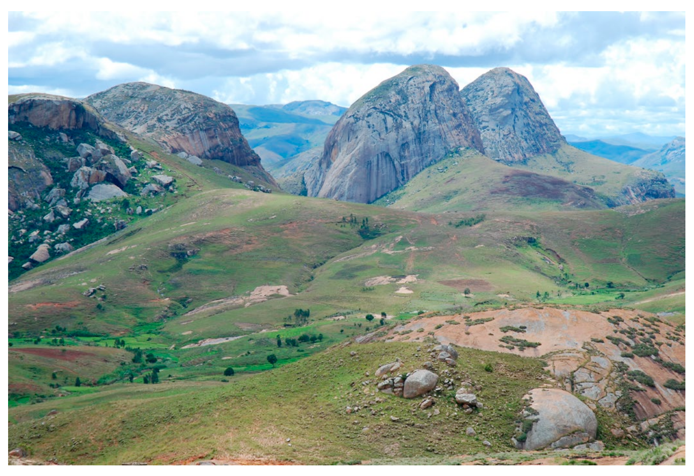
Fig. 1. – Inselberg landscape, near Ambalavao.