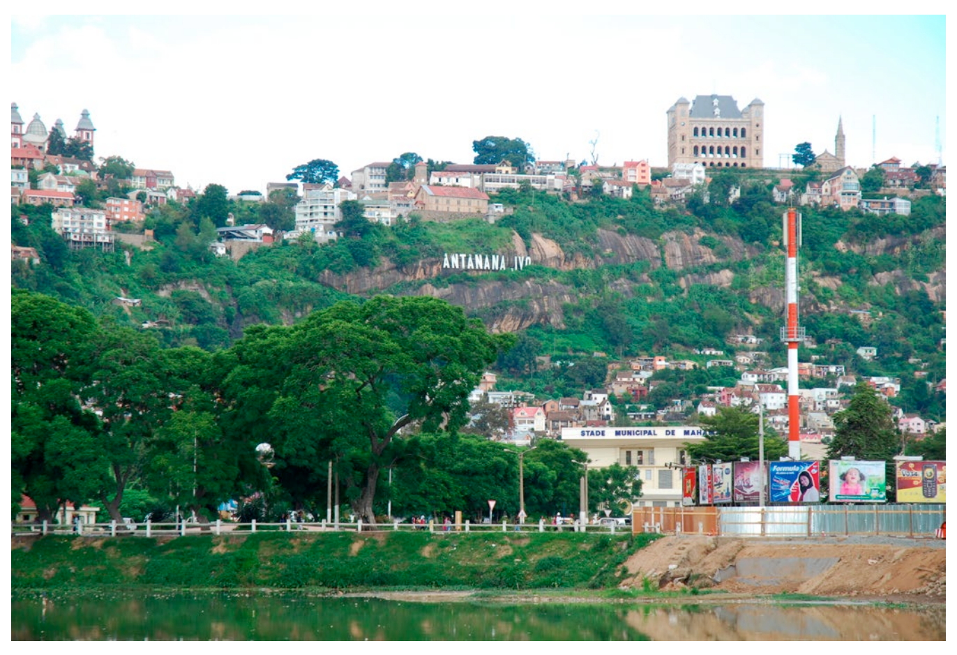
Fig. 2. – Inselberg in the capital Antananarivo with the "Palais de la Reine".

rich in locally endemic species and possess more habitat specialists than similar habitats in most other tropical regions.