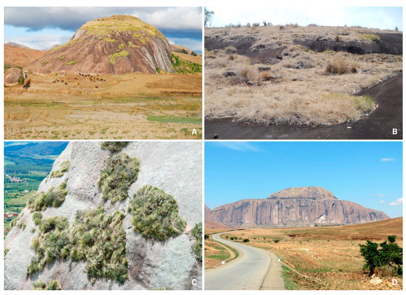
Fig. 6. – A. Inselberg, south of Anja Park (Tangorika) covered with Furcraea foetida (L.) Haw. (Asparagaceae); B. Mat with Styppeiochloa hitchcockii (A. Camus) Cope (Poaceae) near Angavokely; C. Mats formed by Coleochloa setifera (Ridl.) Gilly (Cyperaceae) and steep slopes, south of Fianarantsoa; D. General overview of "Bonnet du Pape, at Voatavo (Fig. 3: n° 26).

exceptions include those within certain National Parks such as Andringitra and Marojejy. In unprotected areas globally, inselbergs often support the last remnants of natural vegetation in a given area. While certain types of human use of inselbergs have occurred for generations and do not seem to have caused severe damage, in recent times human impact appears has become by far more destructive resulting in steadily growing pressure on these areas, and today most inselbergs in Madagascar exhibit detrimental human impacts. These include: the over-collection of certain useful species which impacts local populations or even threatens local endemics with extinction; use of inselbergs for grazing cattle and goats; uncontrolled bush-fires, usually resulting from the widespread burning of grasslands for agriculture, that may significantly impact the population of individual species and which are also responsible for habitat degradation or destruction as a whole (see Whitman et al., 2011 for a study of the influence of fire and water availability