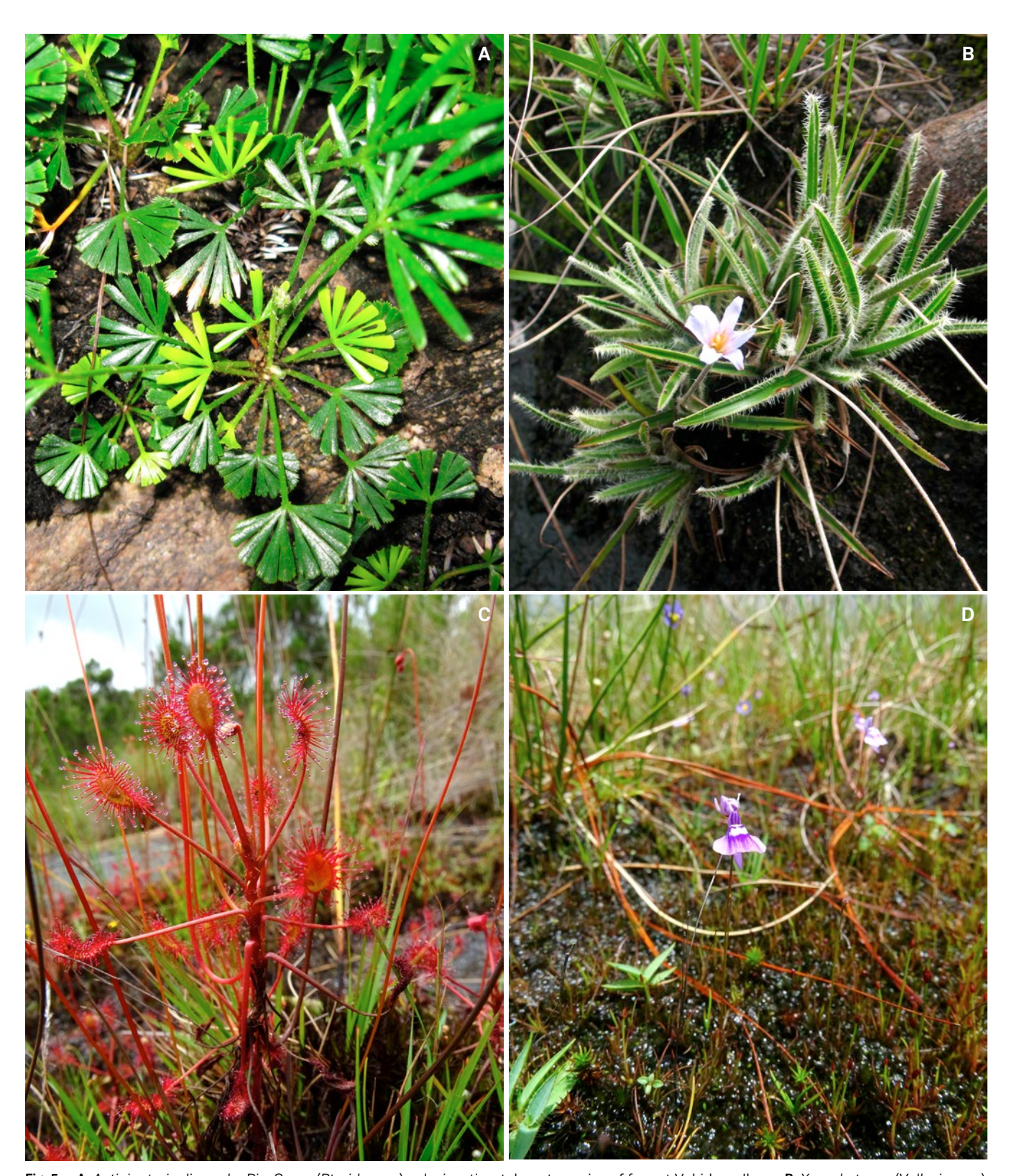
Fig. 5. – A. Actiniopteris dimorpha Pic. Serm. (Pteridaceae) a desiccation-tolerant species of fern at Vohidava, Ihosy; B. Xerophyta sp. (Velloziaceae) near Anjoman'Akona, south of Ambositra; C. Drosera madagascariensis DC. (Droseraceae); D. Utricularia sp. (Lentibulariaceae). [A: Razafindraibe et al. 300; B: Rakotoarivelo et al. 287; C: Rabarimanarivo et al. 745; D: Rabarimanarivo et al. 705]