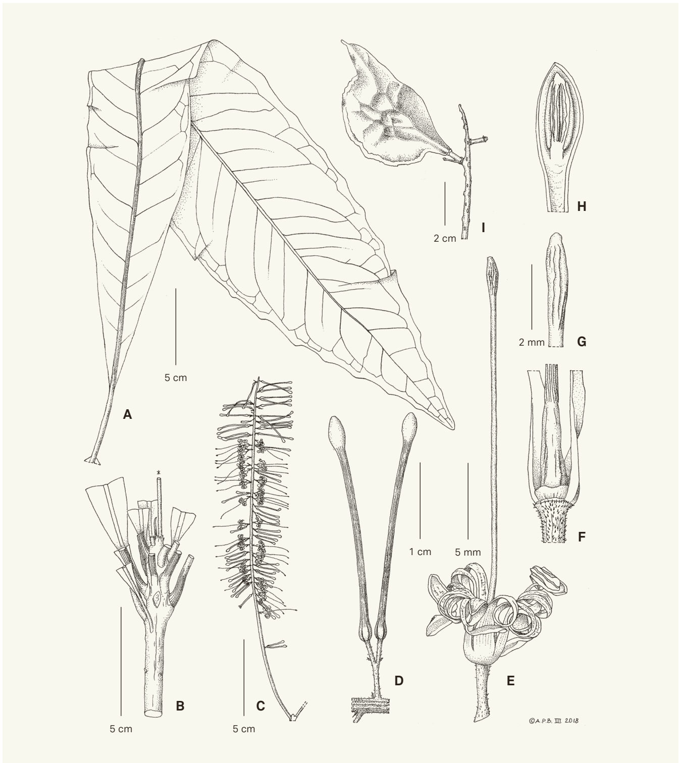
Fig. 1. – Virotia azurea H.C. Hopkins & Pillon. A. Leaf; B. Apex of a shoot showing the arrangement of leaf bases and the base of an inflorescence axis (*); C. Inflorescence (conflorescence), the flowers post-anthesis; D. A flower-pair immediately prior to anthesis, their peduncle subtended by a minute bract and a small bract present at the base of each pedicel; E. A flower post anthesis, the tepals all helically curled; F. Base of a flower, two tepals removed to show the ovary and the cup-like disc around it; G. Apex of the style, slightly swollen and ridged, forming the pollen presenter; H. Distal part of a tepal, inner surface, with the anther attached; I. Immature fruit, note prominent beak. [A, C, E–H: Gâteblé et al. 87, P; B: Munzinger et al. 1462, P; D: MacKee 15159, P; I: MacKee 46274, P] [Drawing: Andrew Brown]