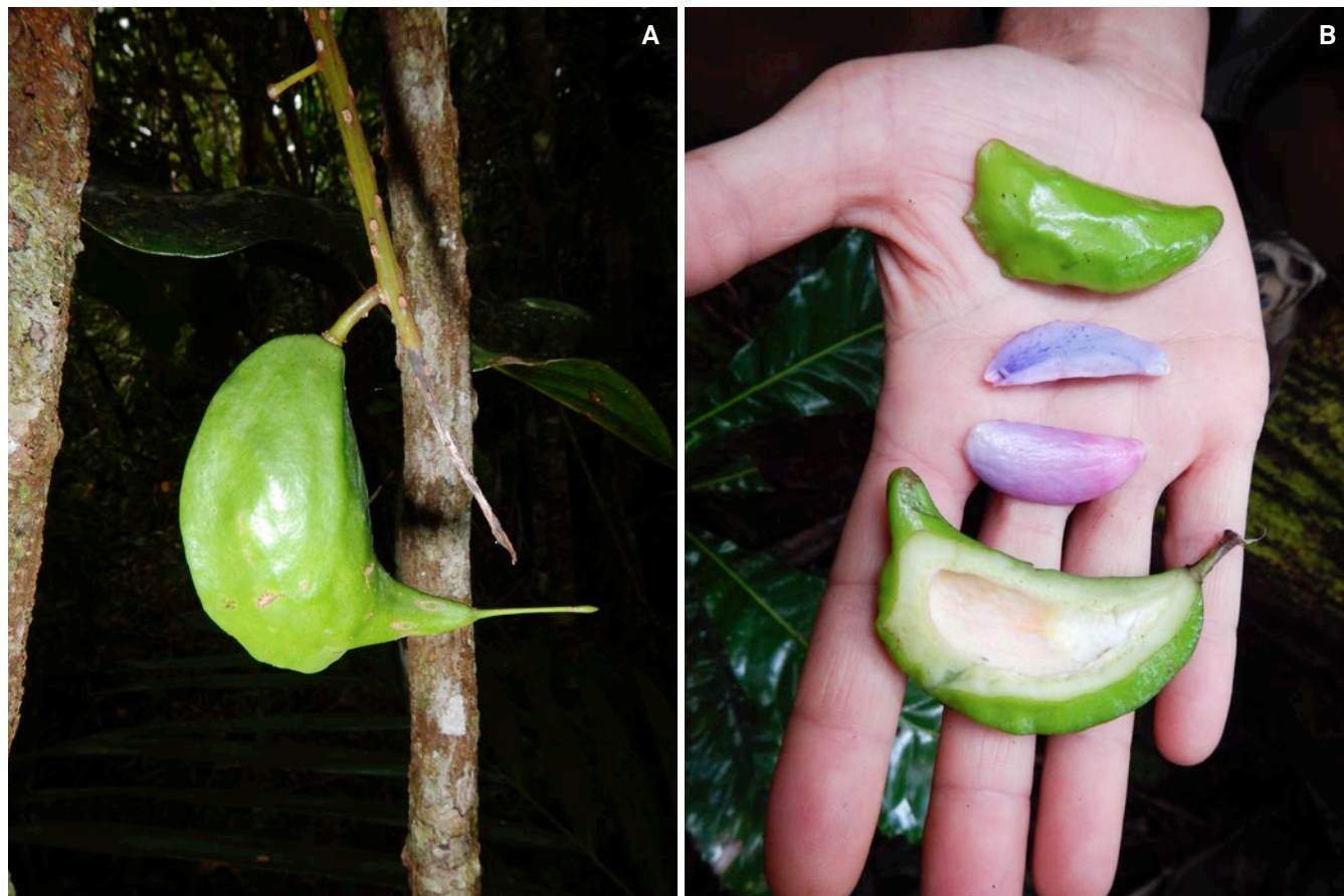
Fig. 3. – Viotia azurea H.C. Hopkins & Pillon. A. Fruit; B. Fruit cut open to reveal the bluish mauve cotyledons.

lobes ovate, thickened, 2.5 \times 1.5 mm, tepal lobes below the tip long and narrow, curling helically, blue to white (including light blue, mid-blue and white-violet), their inner surface glabrous. Stamens : free part of the filament very short, each one inserted towards the base of the ovate tip of a tepal; anthers 2 \times 1 mm, the connective shortly prolonged at the apex. Disc an erect, hypogynous cup or collar, thin, glabrous, slightly undulate along the top margin to shallowly 4-lobed or the lobes sometimes splitting to the base, maximum height 0.4 mm. Gynoecium : ovary cylindrical-conical, 1.5\text{--}2.5 \times 0.8 mm, glabrous or with a few minute hairs, blue or violet; style cylindrical, long and slender, 21\text{--}30 \times 0.5 mm, glabrous, \pm white, the distal 2.5 mm forming a slightly swollen pollen presenter, this glabrous and shiny black with longitudinal ridges when dry; stigma a short terminal slit. Fruit few per infructescence, each borne on a thickened pedicel/peduncle c. 8 mm long, somewhat laterally compressed, crescent shaped or ventral part \pm elliptic in outline with a marked beak at the end of the dorsal margin, c. 7.3 cm long (including the beak 1.5 cm long) \times 3.5 cm deep (between the mid-points of the ventral and dorsal margins); epicarp bright or dark shiny green, glabrous; seed (based on Gâteblé et al. 449) 1 per fruit, almond-shaped,