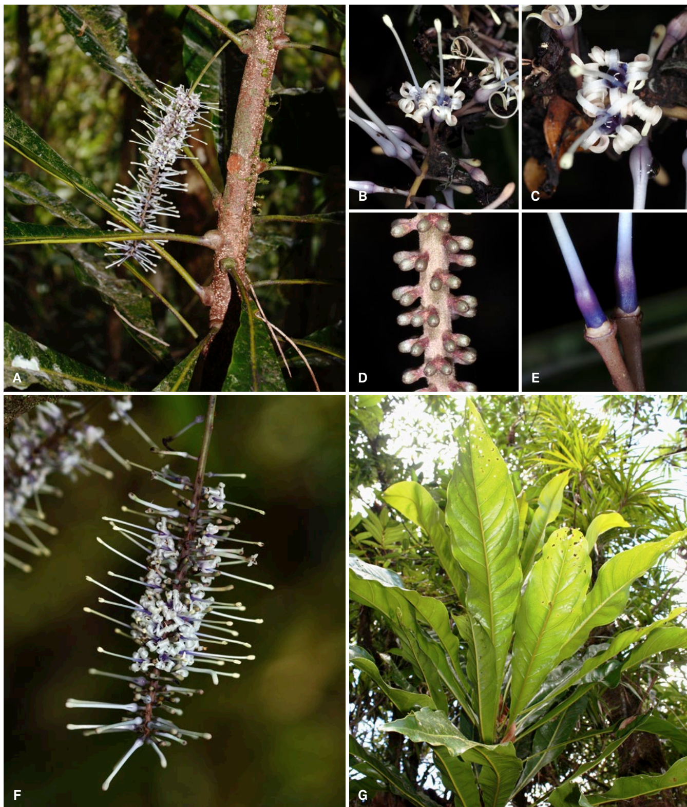
Fig. 2. – Virotia azurea H.C. Hopkins & Pillon. A. Inflorescence arising from a leaf axil; B. A flower-pair at anthesis plus flower buds; C. Pair of flowers (note helically curled tepals and nectar); D. Very young floral buds; E. Two purple ovaries (note disc at base) and white styles; F. Inflorescence; G. Under surface of foliage.