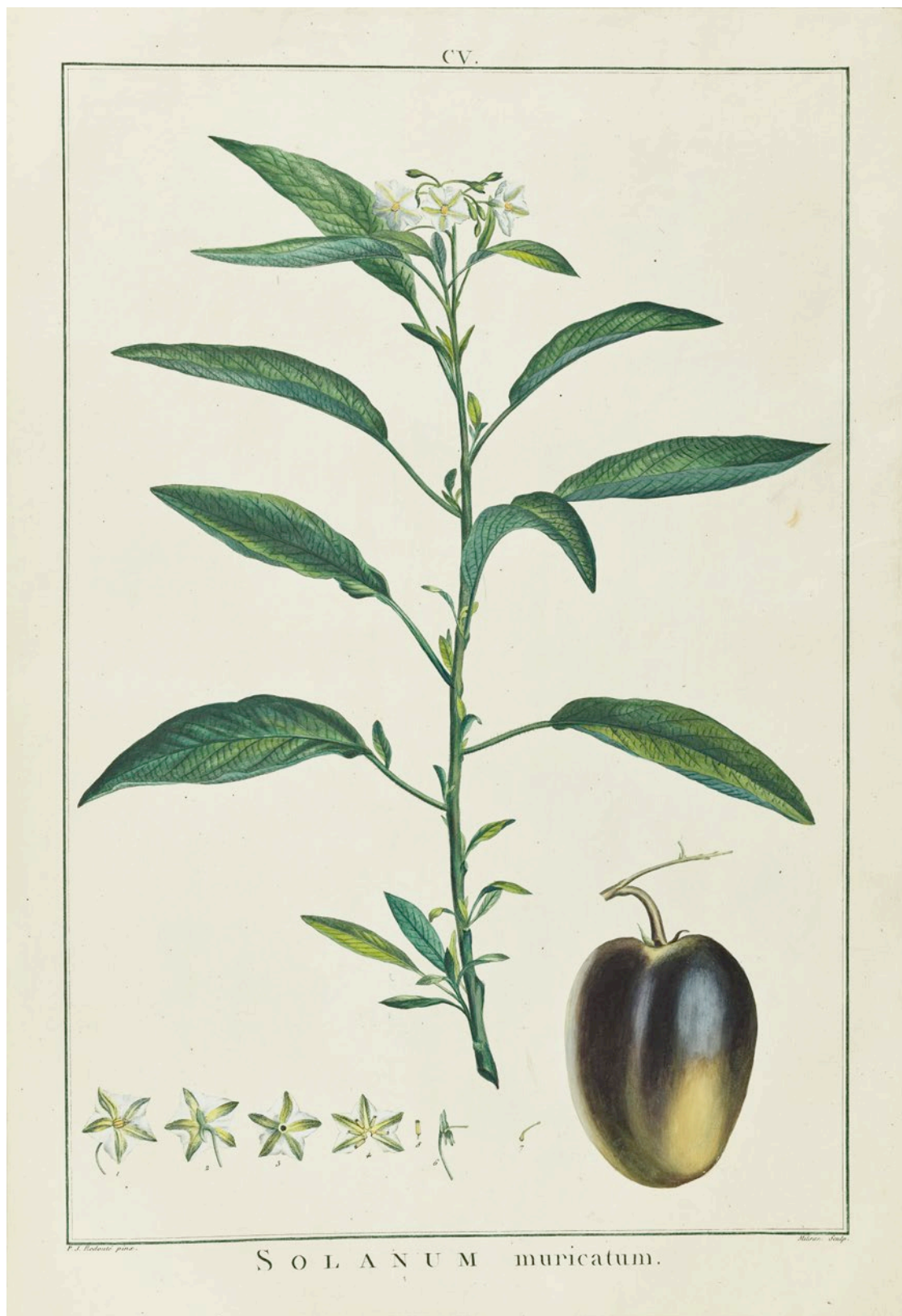
Fig. 3. – Solanum muricatum Ait. Copper engraving based on P.-J. Redouté, no date. [L'Héritier's Reliquiae ]