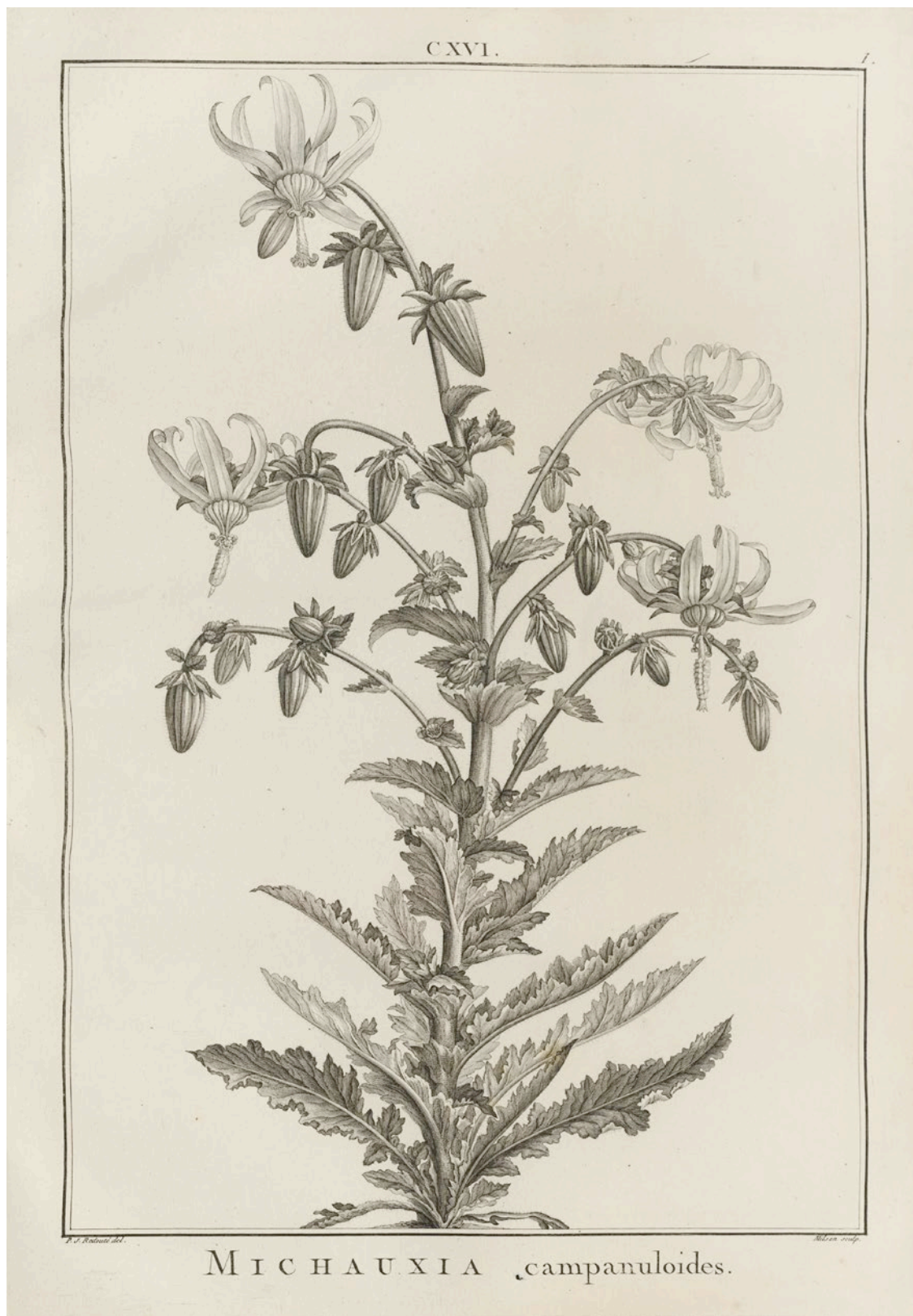
Fig. 6. – Michauxia campanuloides L'Hér. Copper engraving based on P.-J. Redouté, no date. [Tabulae ineditae: tab. 116]