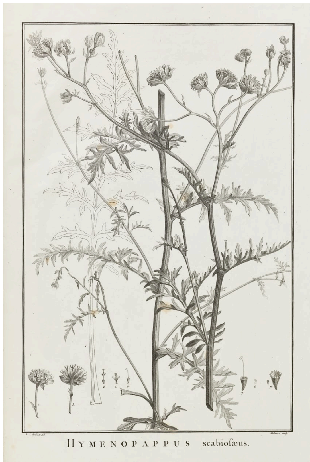
Fig. 2. – Hymenopappus scabiosaeus L'Hér. Copper engraving based on P.-J. Redouté, 1788. [ L'Heritier's Reliquiae ] [Bibliothèque, Conservatoire et Jardin botaniques de Genève]