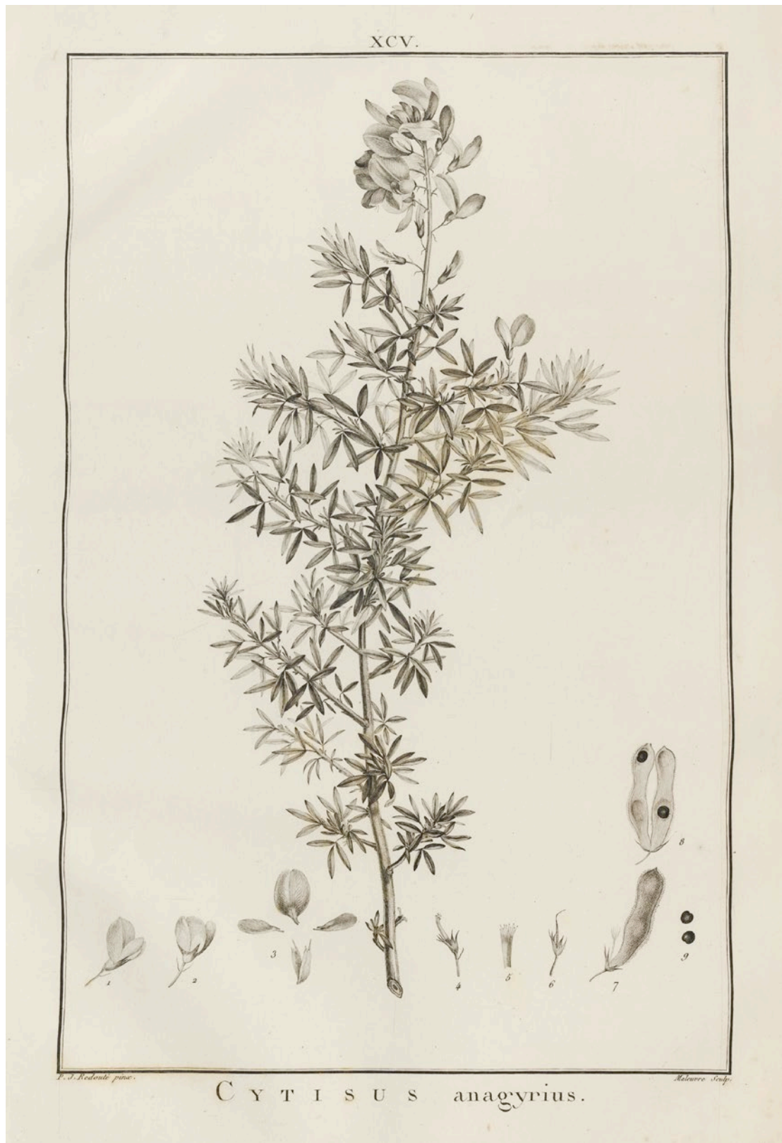
Fig. 5. – Cytisus anagyrius L'Hér. (= Adenocarpus hispanicus (Lam.) DC.). Copper engraving based on P.-J. Redouté, no date. [Tabulae ineditae: tab. 95]