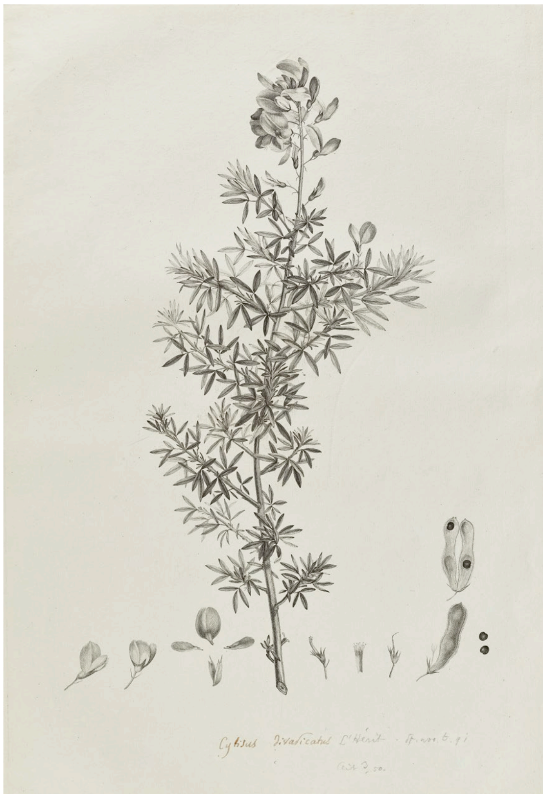
Fig. 4. – Cytisus anagyrius L'Hér. (= Adenocarpus hispanicus (Lam.) DC.). Copper engraving based on P.-J. Redouté, avant la lettre, no date. [L'Heritier's Reliquiae] [Bibliothèque, Conservatoire et Jardin botaniques de Genève]