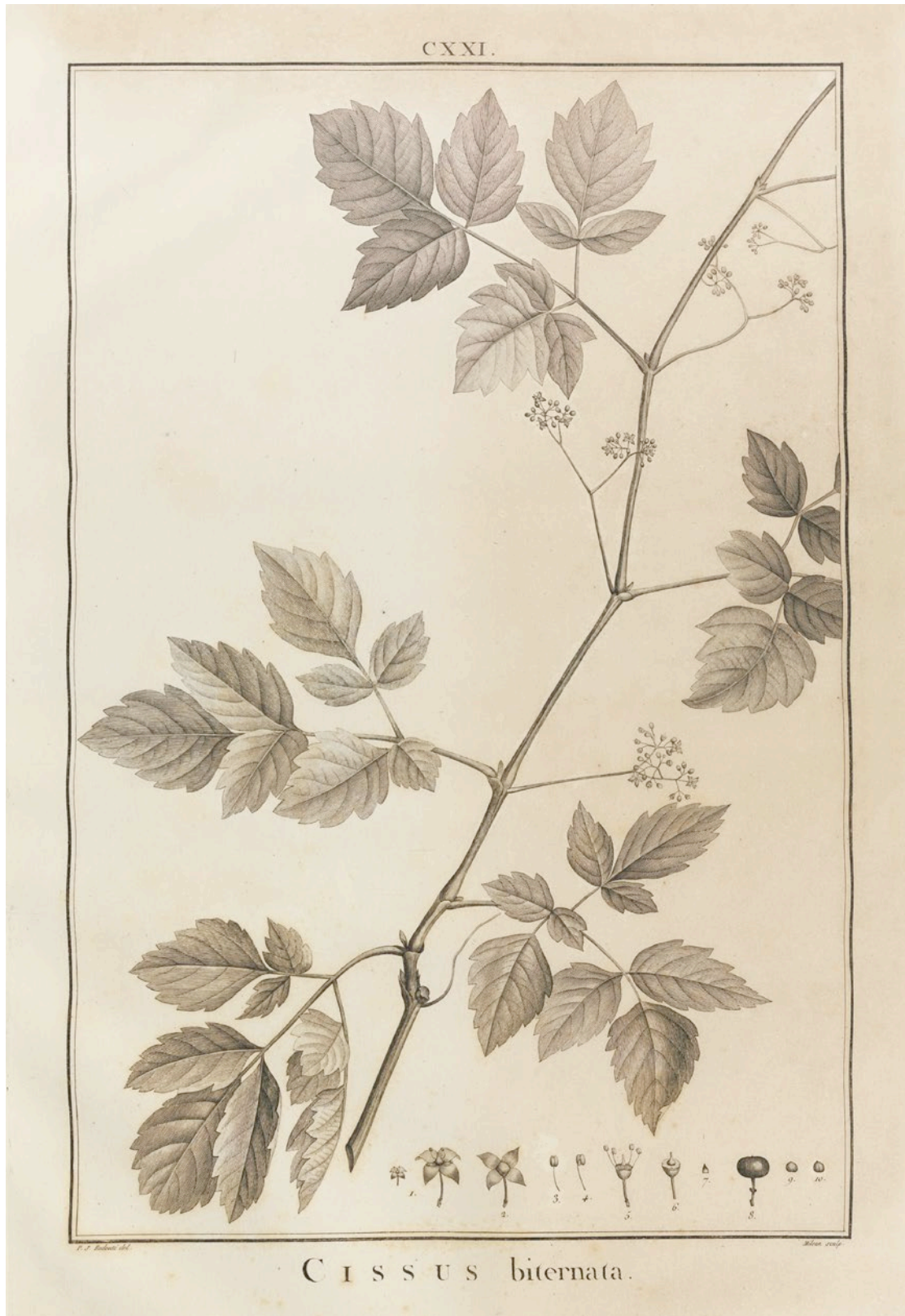
Fig. 9. – Cissus biternata L'Hér. Copper engraving based on P.-J. Redouté, no date. [Tabulae ineditae: tab. 121]