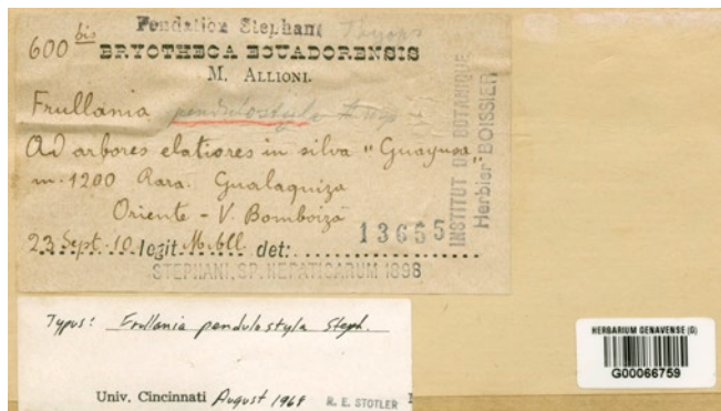
Fig. 2. – Label of holotype of Frullania pendulostyla Steph. at G.

only in 1953. Allioni's labels therefore frequently mention Azuay as province of origin of the specimen, instead of Morona Santiago. The only collections made by Allioni in Azuay, as currently defined, are from Chunchi and Cuenca, gathered in January 1909 while travelling from Guayaquil to Gualaquiza, and from the páramo of Matanga near the provincial border with Morona Santiago, visited by Allioni in October 1909 and again in November 1910.